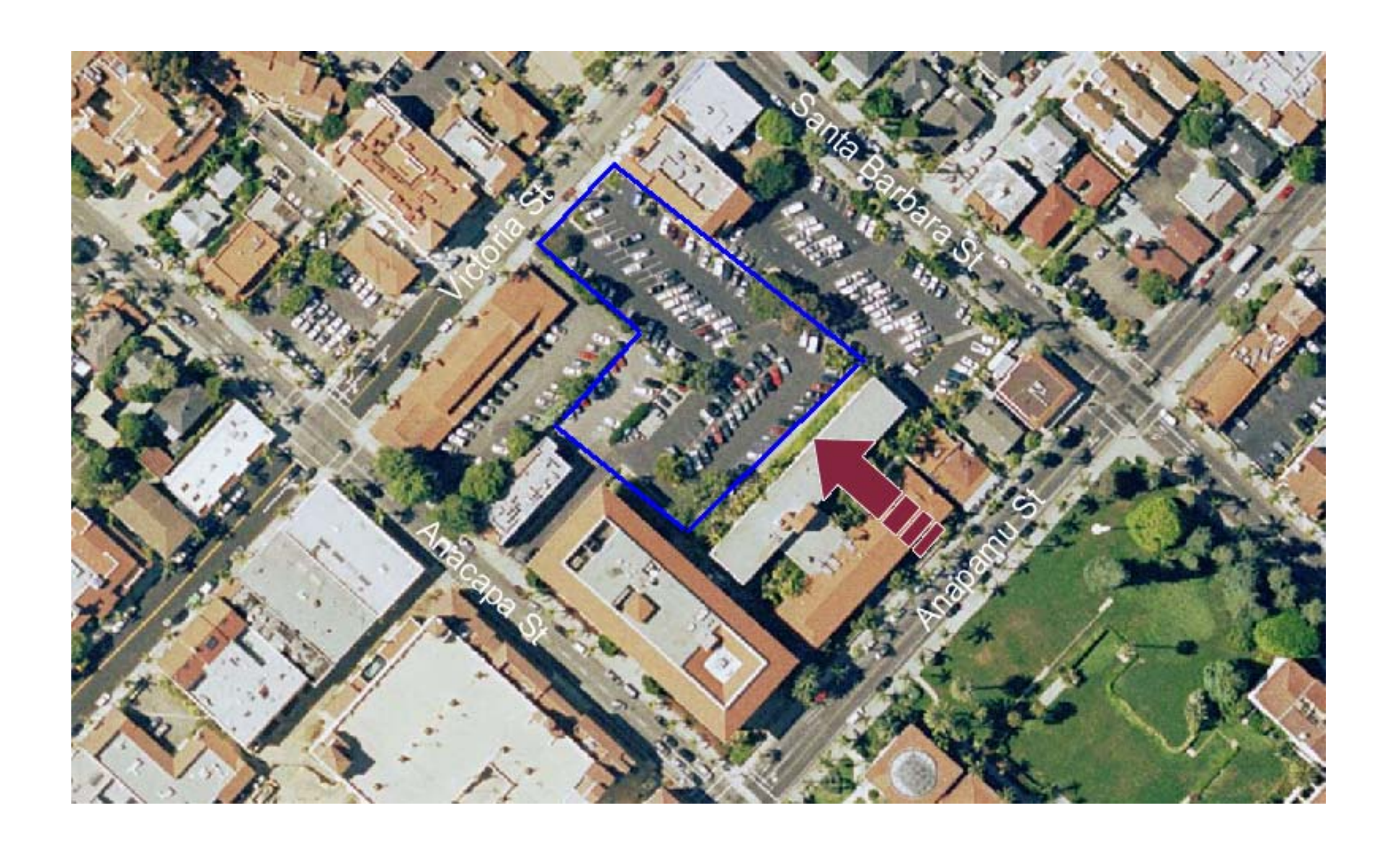
EXHIBIT A – Admin Lot