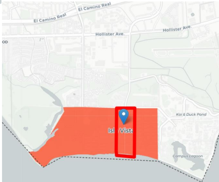
Tract 0029.26 – 68.9% mail-in return rate