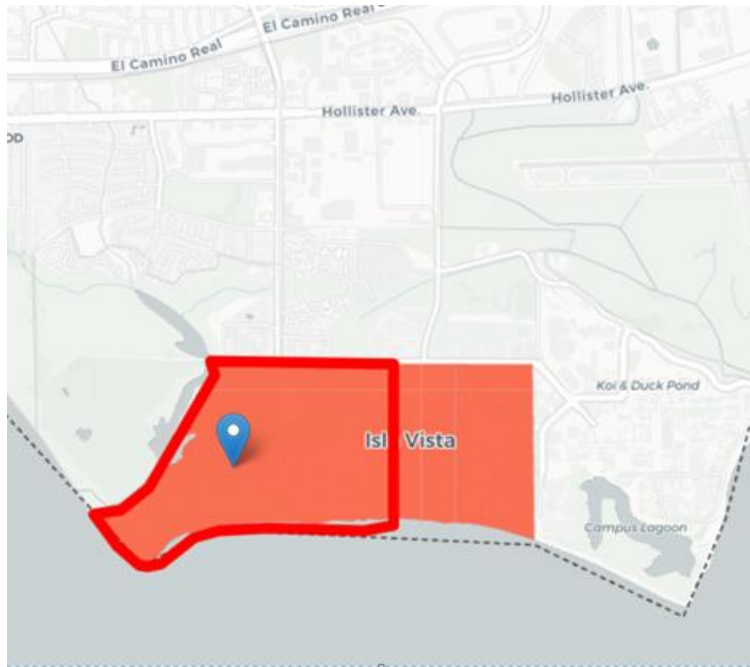
Tract 0029.28 – 65.2% mail-in return rate