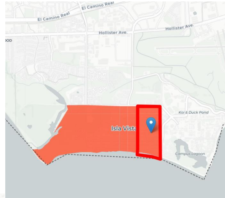
Tract 0029.24 – 66.8% mail-in return rate