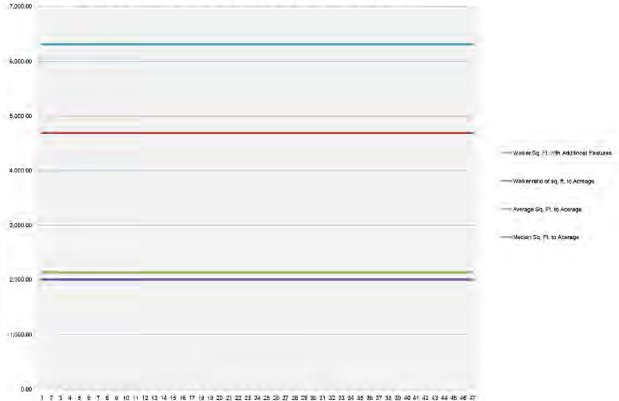
Average and Median Gross Square Footage per Acre, Walker property included