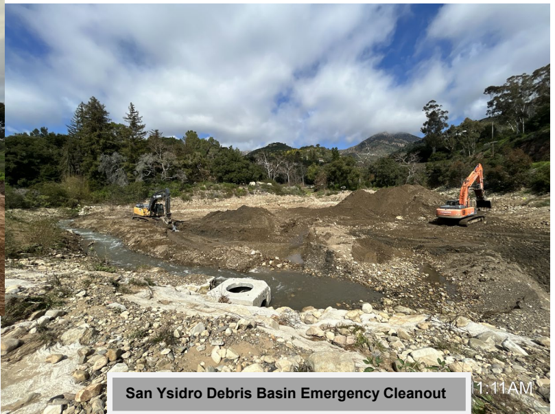
San Ysidro Debris Basin Emergency Cleanout