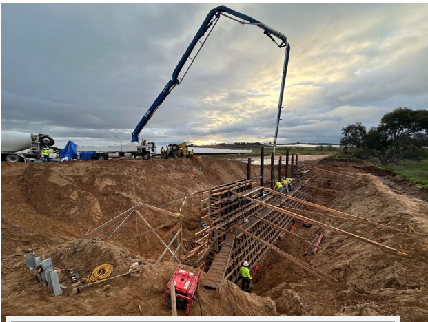
Orcutt Eastside Farm Land Basin Construction