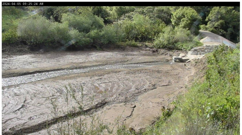
San Antonio Creek Debris Basin Emergency Cleanout