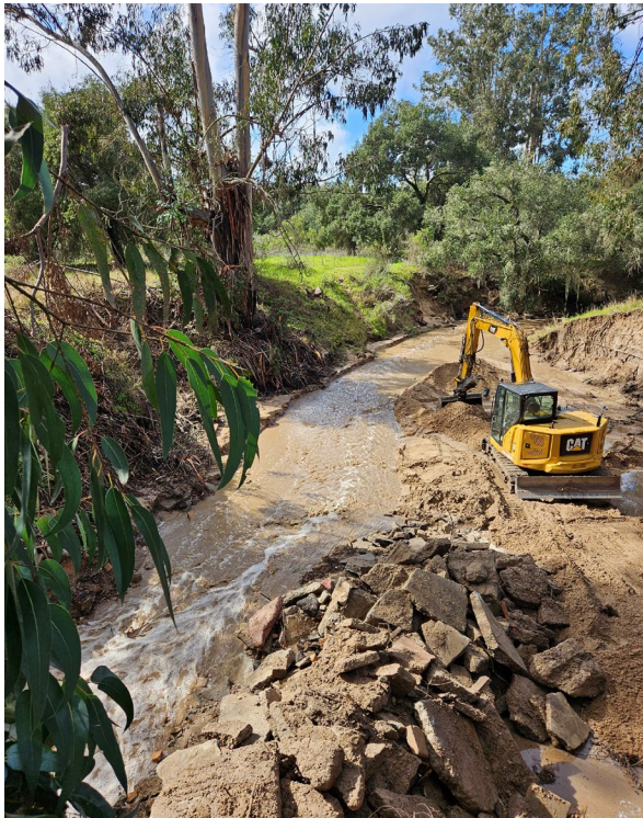
Orcutt-Solomon Creek Debris Basin Emergency Cleanout