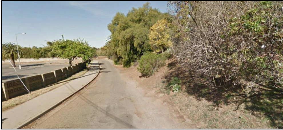
Eastern Leg of San Simeon Drive (Looking west)

Public Works received a request from a resident for no parking to be installed on both sides of San Simeon Drive in the one lane section. Public Works recommends that your Board adopt the proposed “no stopping, standing or parking” zone on both sides of San Simeon Drive in the one lane section to ensure public safety.