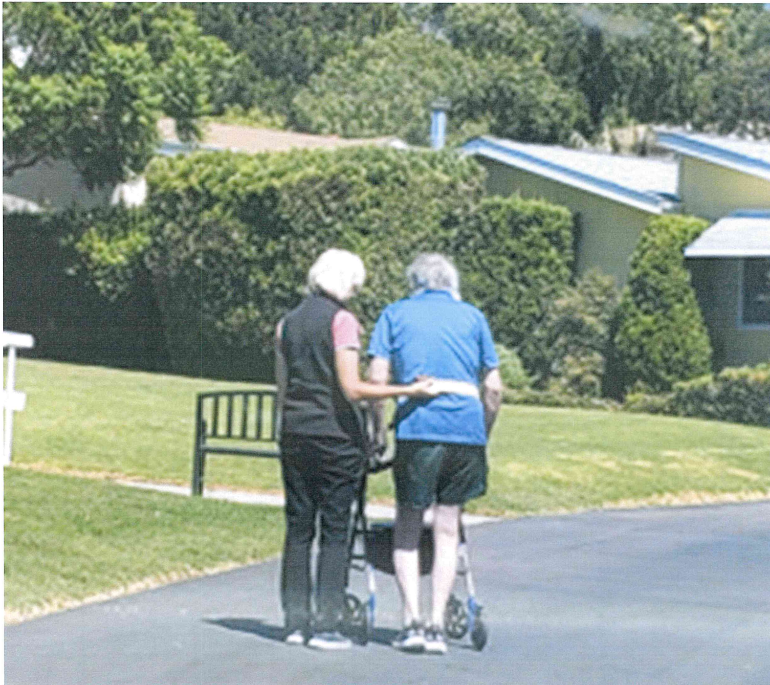
SAN VINCENTE SENIOR MOBILE HOME PARK RESIDENT WITH WALKER & ASSISTANT USING STREET (THERE ARE NO SIDEWALKS, EXCEPT AT CLUBHOUSE)