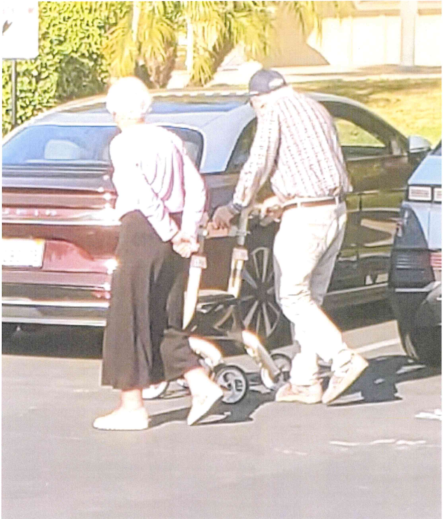
SAN VINCENTE SENIOR MOBILE HOME PARK – RESIDENTS WITH WALKER – 2 ND PHOTO