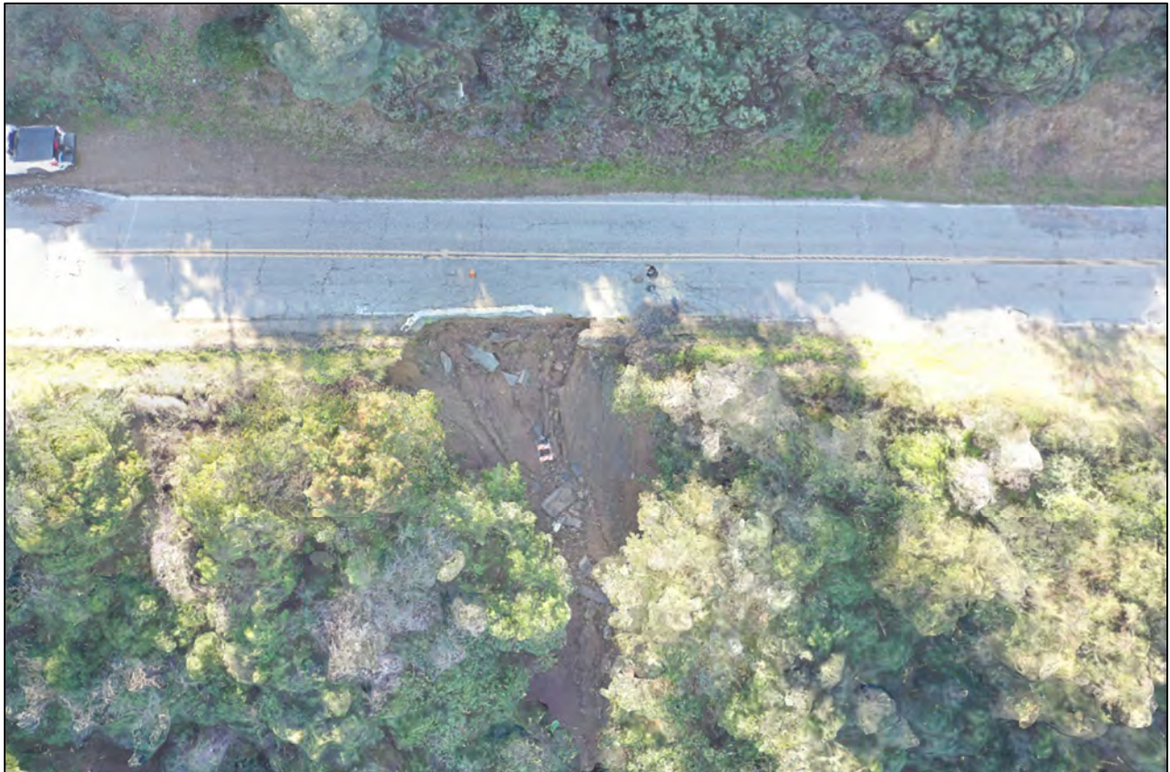
Figure 1: Aerial View of site

Access Limited Construction (ALC) is pleased to offer this Proposal for Design-Build Construction Services for the referenced project. This proposal is exclusively for County of Santa Barbara, herein known as the "Client", to consider. The project site is located at 5370-5302 East Camino Cielo Road in Santa Barbara, CA (GPS point: 34.514572, -119.800047). We thank you for the opportunity to provide these services to you and this project.