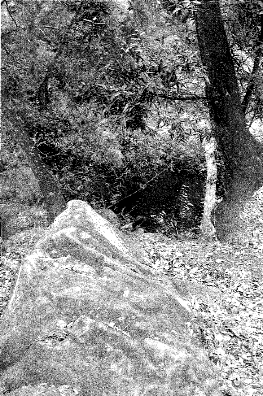
This deep, year round pool in the riparian habitat of this Rocky Nook Park section of Mission Creek is one of the few places where landlocked endangered Southern CA steelhead trout ( Oncorhynchus mykiss ) can still survive.