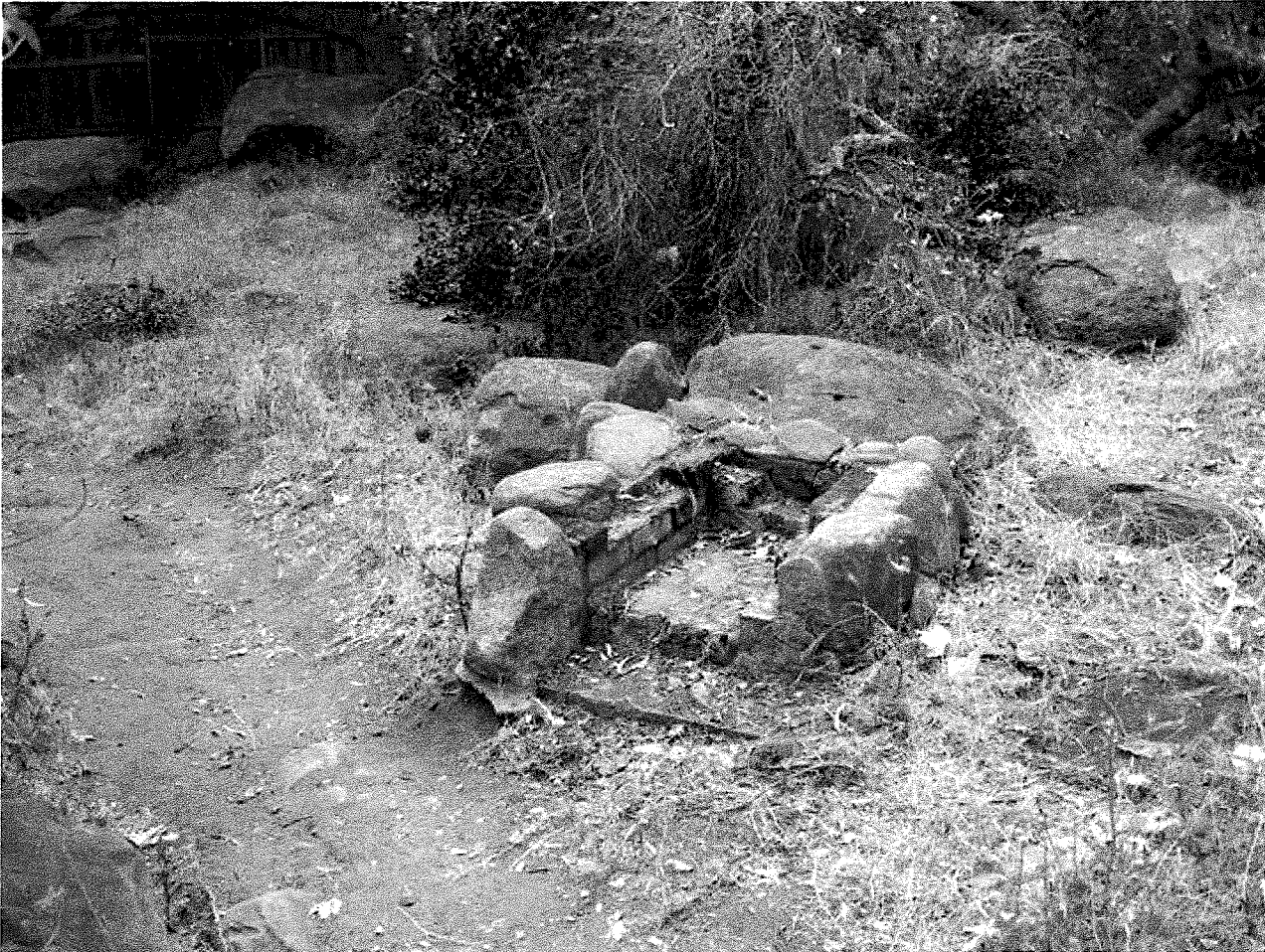
This is one of two remnant stone barbecue pits left in Rocky Nook Park. These were made in the 1930s by the Works Progress Administration (Depression Era WPA).

Spanish/Mexican Period stone foundation was saved and incorporated into the caretaker's cottage in 1932 and kept as part of the Co. Parks' Dept. Office addition/renovation in 1984. This is an important and unique historic feature.