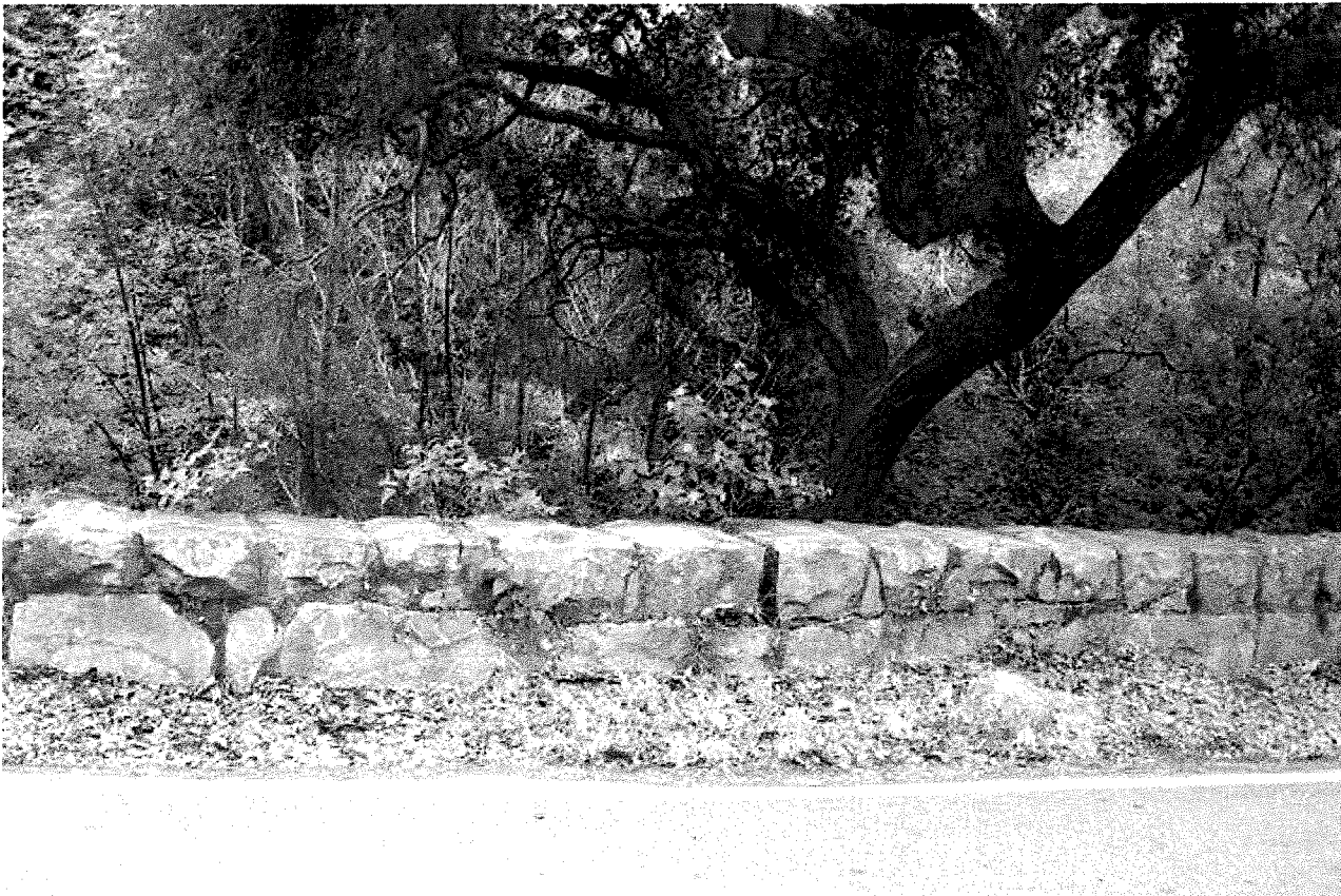
Hundreds of feet of finely handcrafted, unobtrusive, durable and functional historic sandstone retaining walls line Mission Creek's Creek, native CA Riparian habitat, and sections of the Park's driveway. Flowers are CA native Canyon sunflower ( Venegasia carpesioides ).