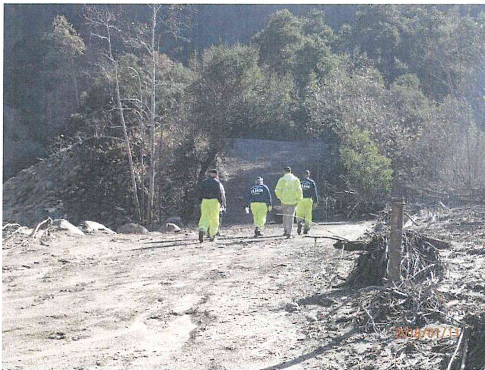
Carpinteria Creek watershed damage, Jan 2018