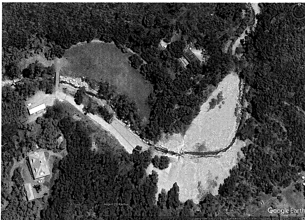
Proposed creek restoration areas