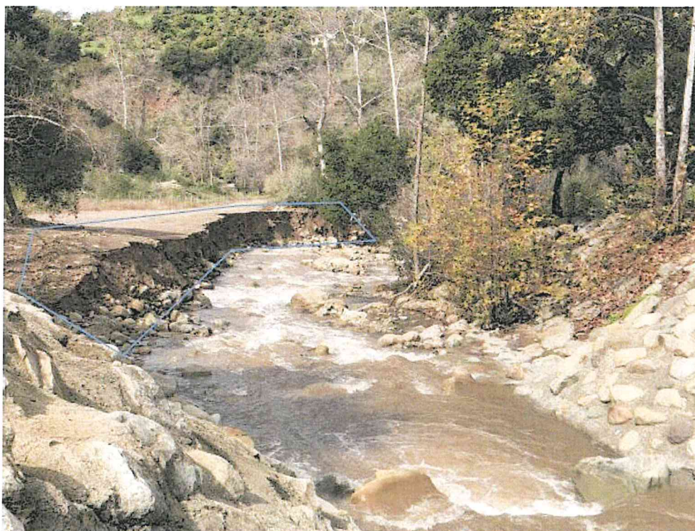
Proposed creek restoration area