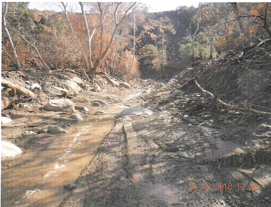
Carpinteria Creek watershed damage, Jan 2018