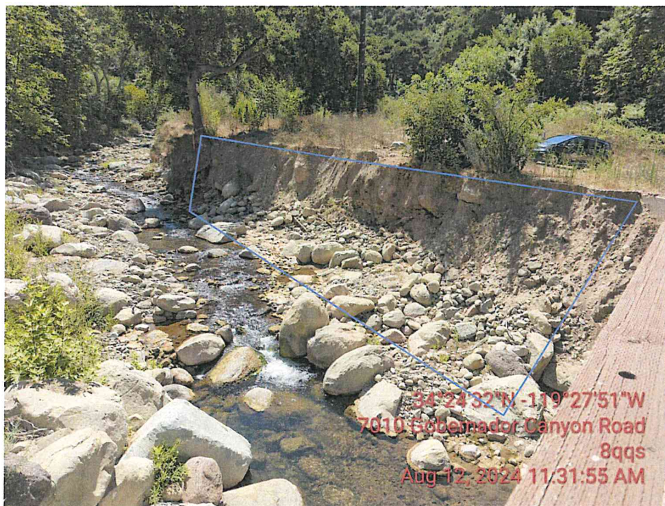
Proposed creek restoration: West area