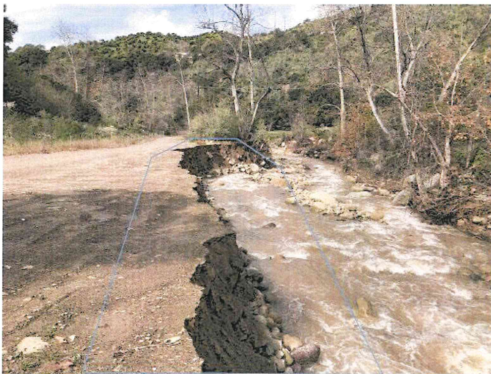
Proposed creek restoration: East-area