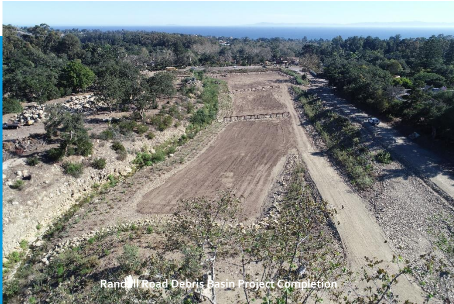
Randall Road Debris Basin Project Completion