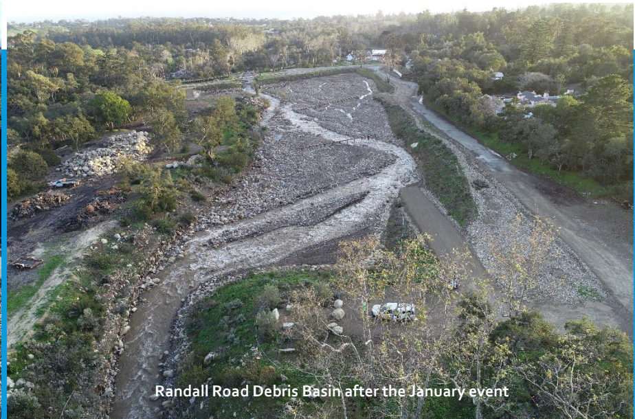
Randall Road Debris Basin after the January event