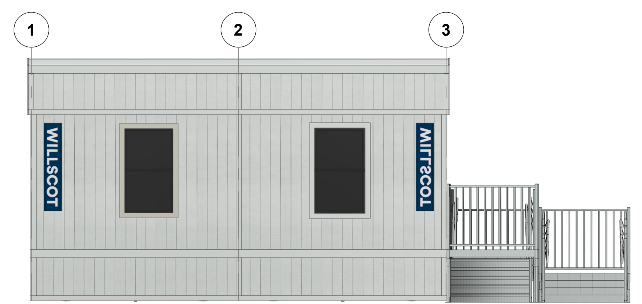
5 PLAN WEST 3/16" = 1'-0"