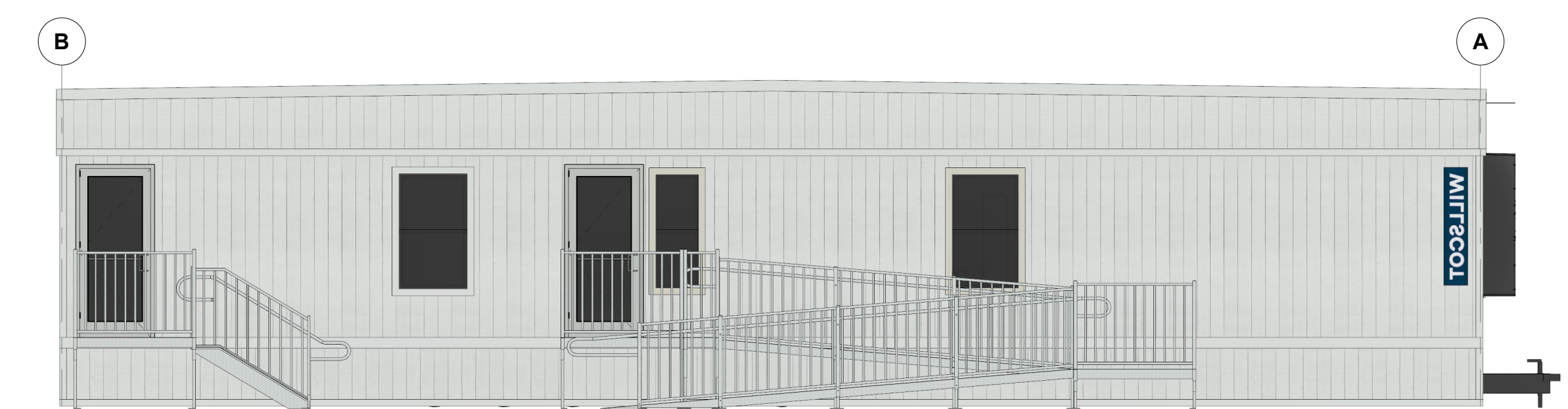
4 PLAN SOUTH 3/16" = 1'-0"