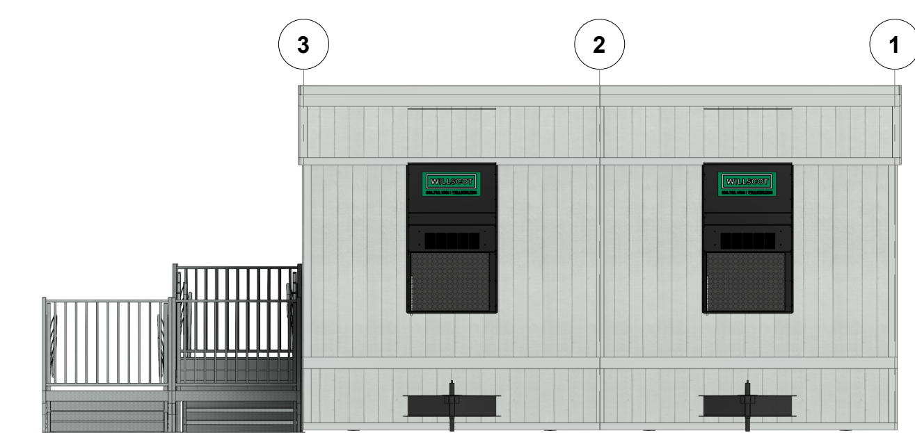
6 PLAN EAST 3/16" = 1'-0"

PRELIMINARY DRAWING NOT FOR CONSTRUCTION