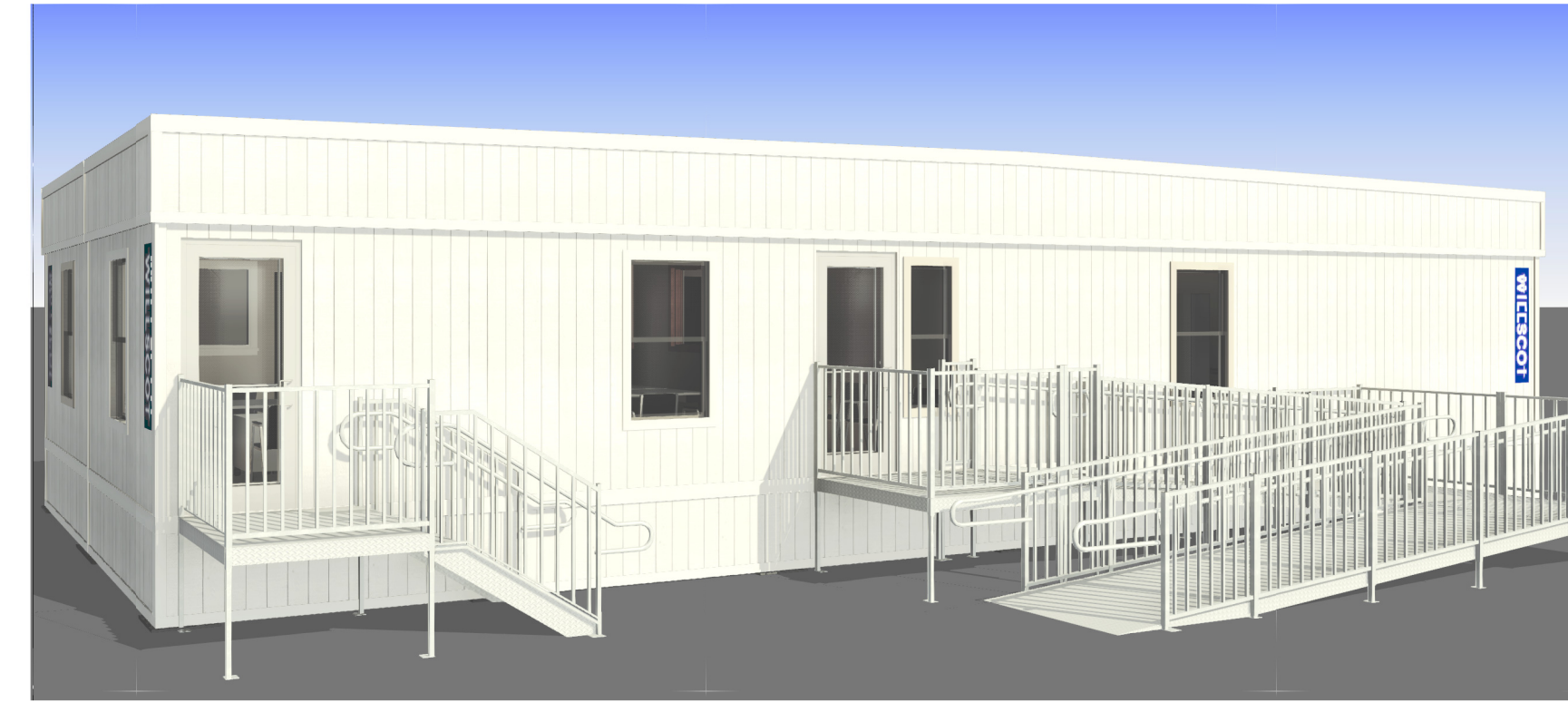
2 3D ELEVATION