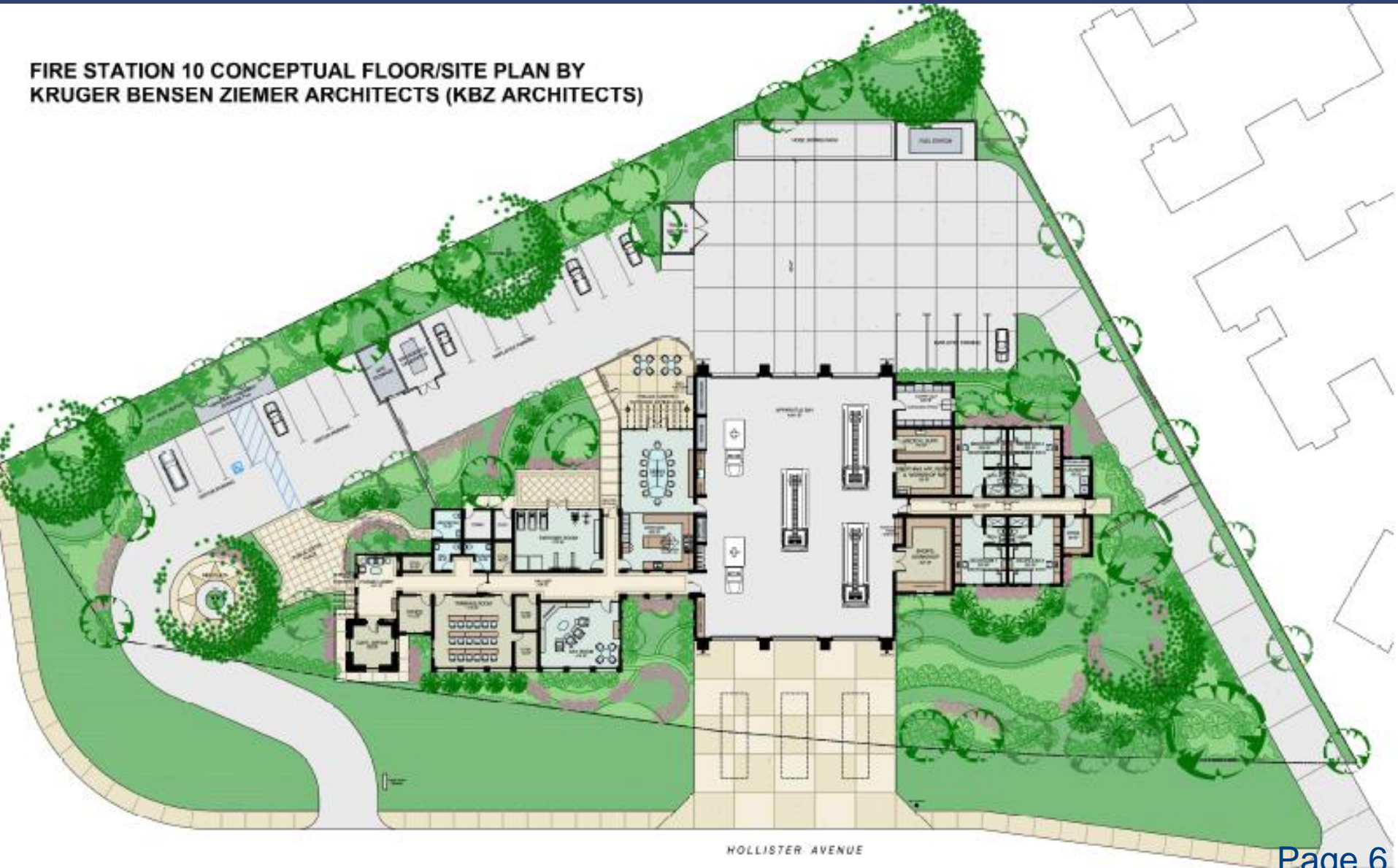
FIRE STATION 10 CONCEPTUAL FLOOR/SITE PLAN BY KRUGER BENSEN ZIEMER ARCHITECTS (KBZ ARCHITECTS)