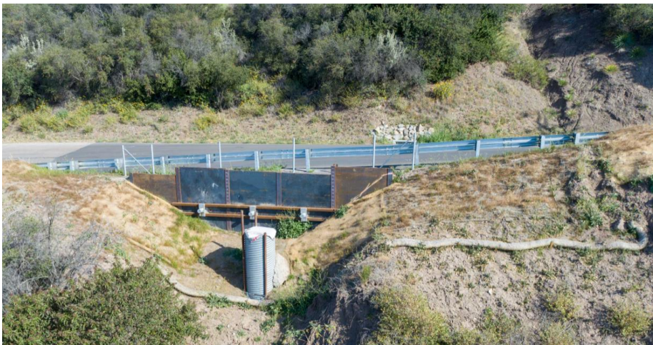
San Marcos Road MP 1.94 – Construction complete