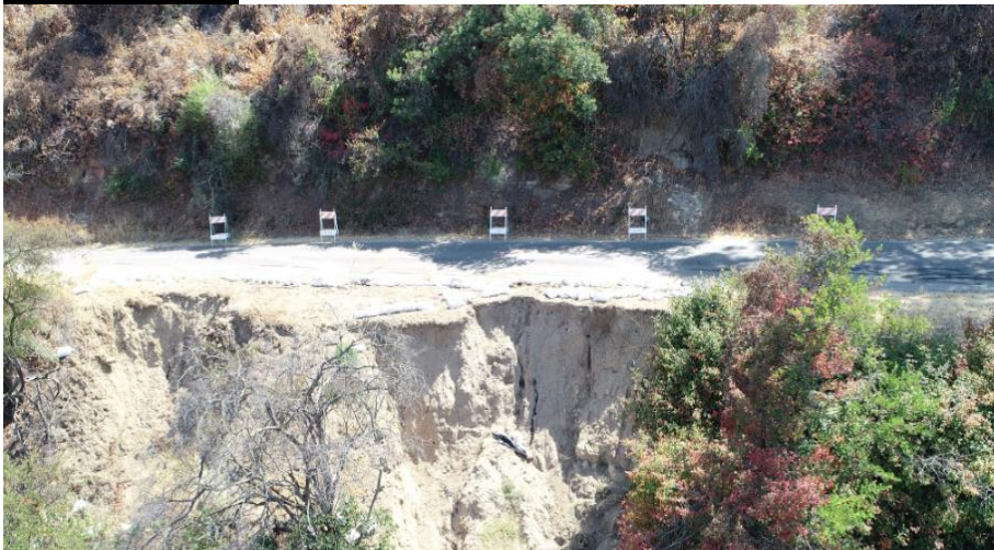
After 2017 Storms