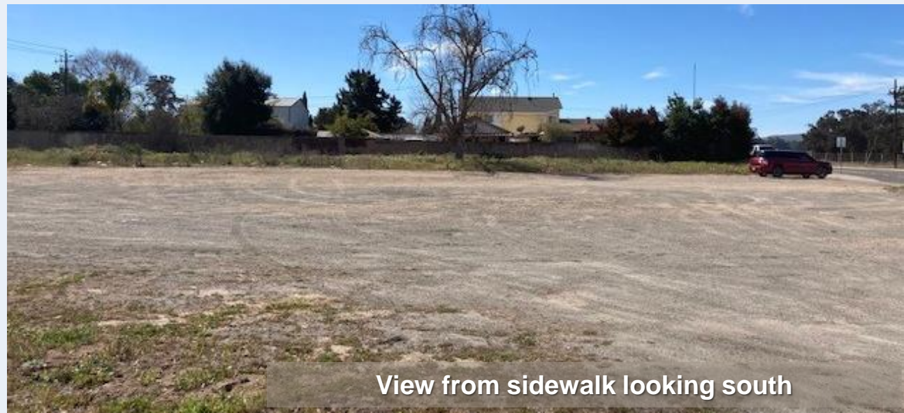
View from sidewalk looking south