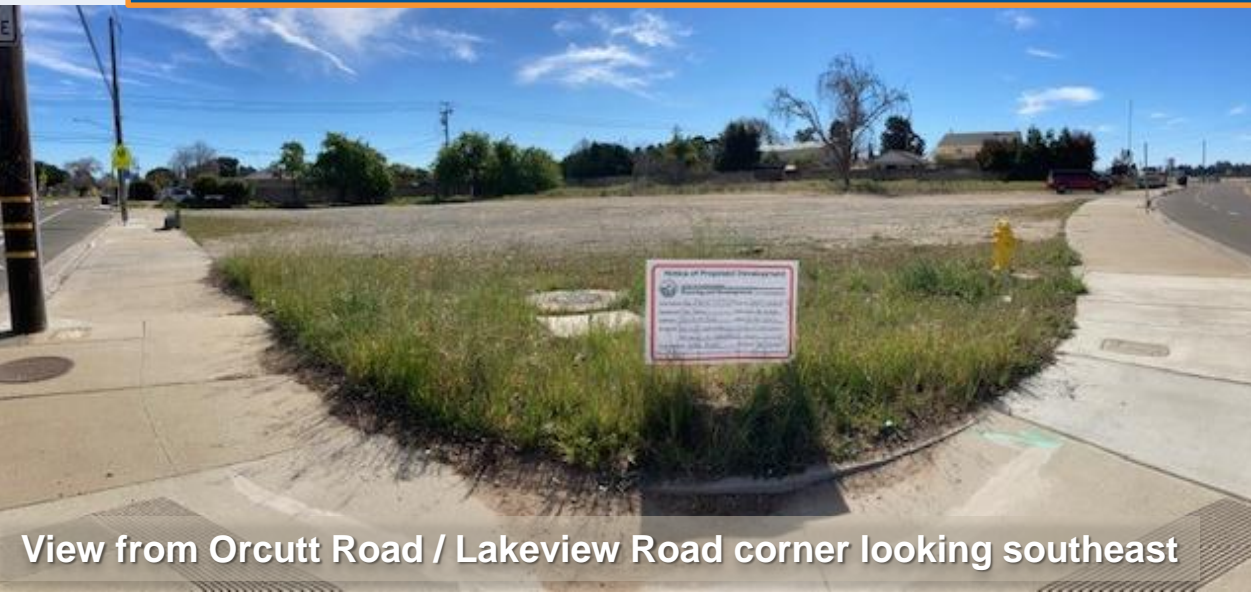
View from Orcutt Road / Lakeview Road corner looking southeast