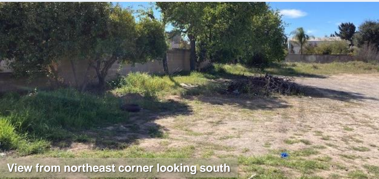
View from northeast corner looking south