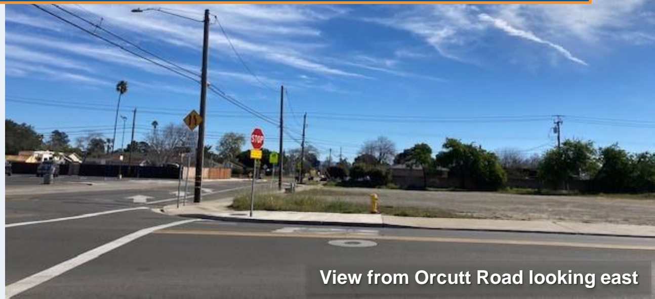
View from Orcutt Road looking east