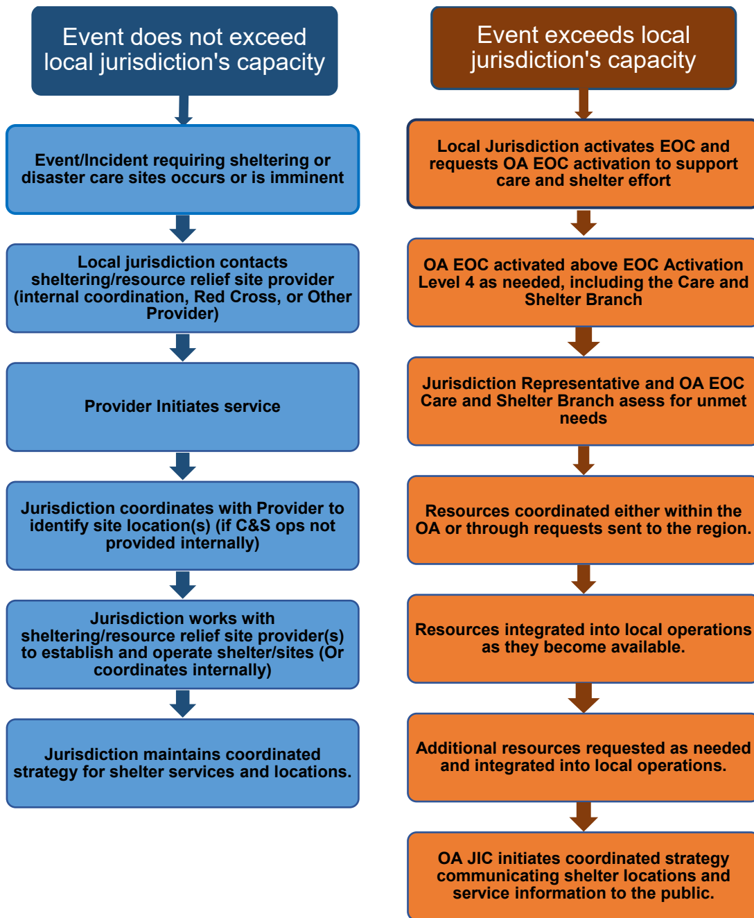
Figure 1 Activating Disaster Care Site Resource Support and Coordination.