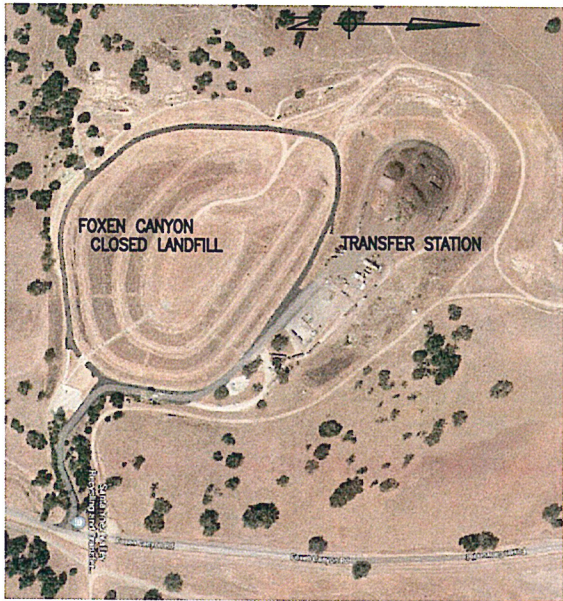
TRANSFER STATION LOCATION