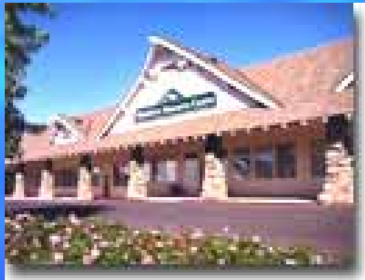
1444 S. Broadway Santa Maria