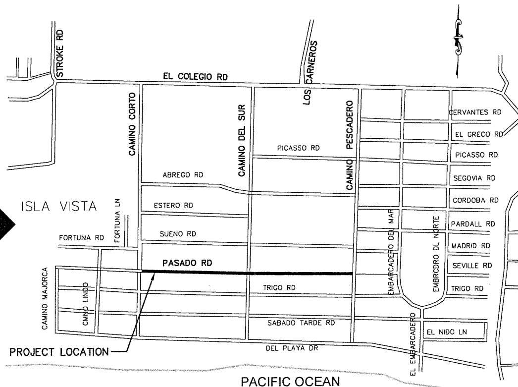
PROJECT VICINITY MAP NTS

NOTE: IT SHALL BE THE RESPONSIBILITY OF THE CONTRACTOR TO WORK WITH THE LOCAL UTILITY COMPANIES TO LOCATE ALL UNDERGROUND UTILITY SERVICE LINES WITHIN THE PROJECT LIMITS. CALL UNDERGROUND SERVICE ALERT AT (800) 422-4133 OR 811 A MINIMUM OF TWO WORKING DAYS PRIOR TO ANY EXCAVATION WORK.