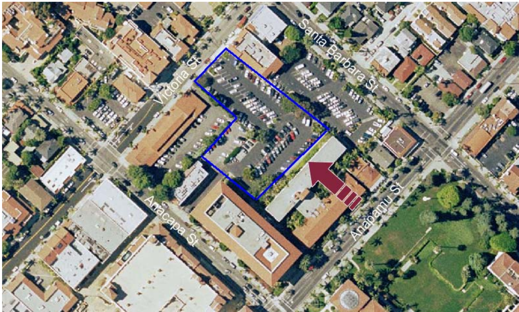
EXHIBIT A – Admin Lot