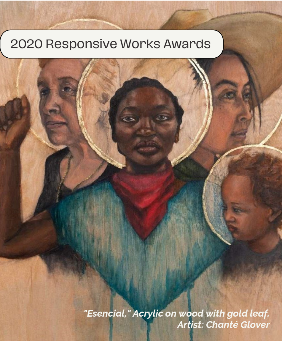
"Esencial," Acrylic on wood with gold leaf. Artist: Chanté Glover