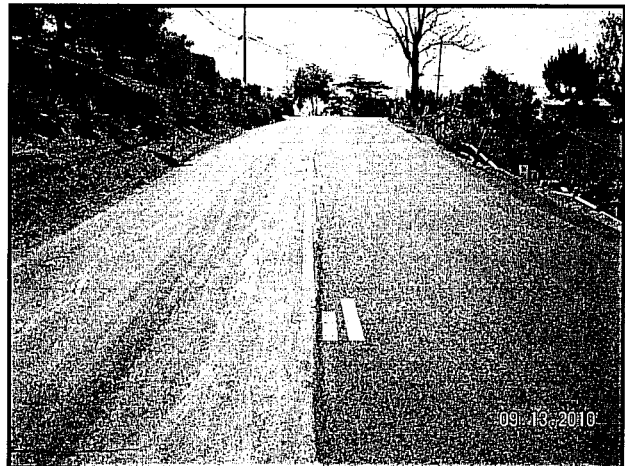
Palomino Road - After