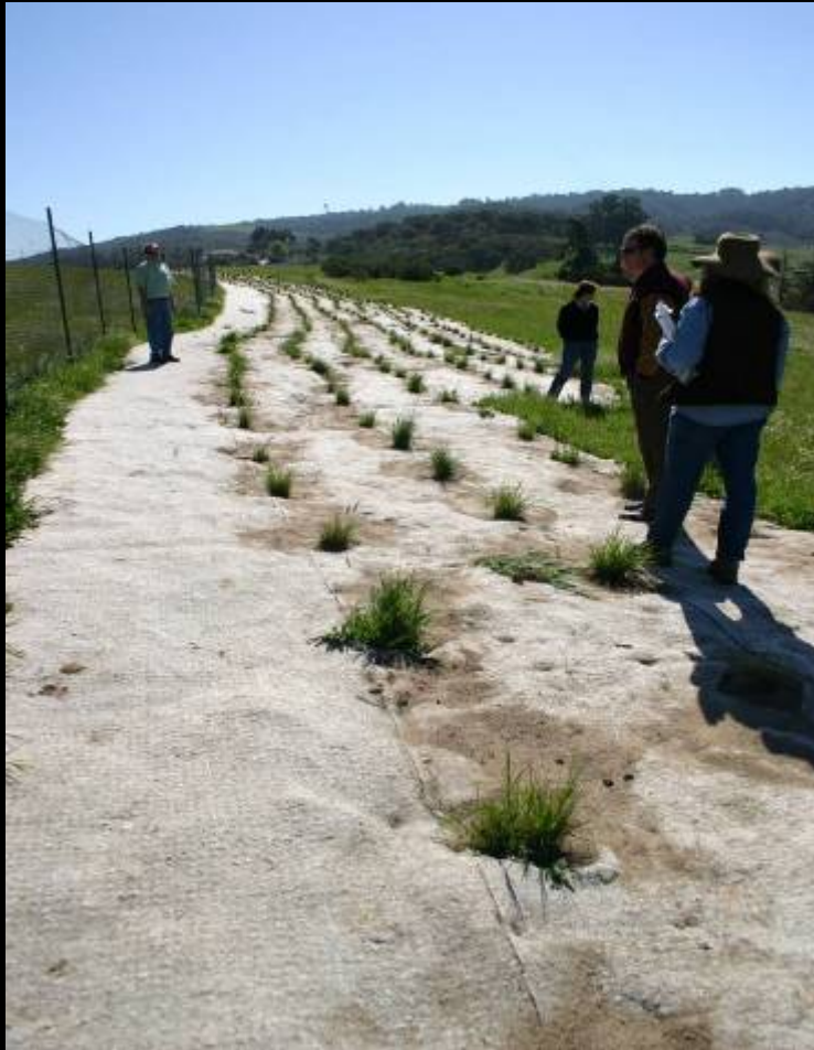
Restoration example photo