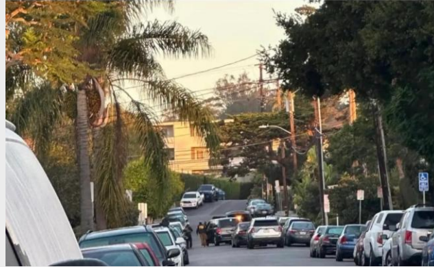
Federal agents arresting 4 people steps away from SB City College campus.