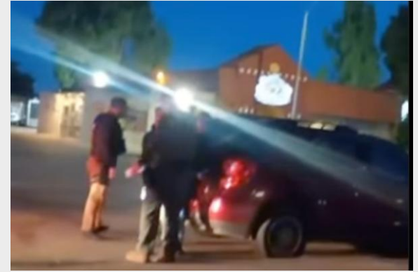
Federal agents take a man into custody in Santa Maria.