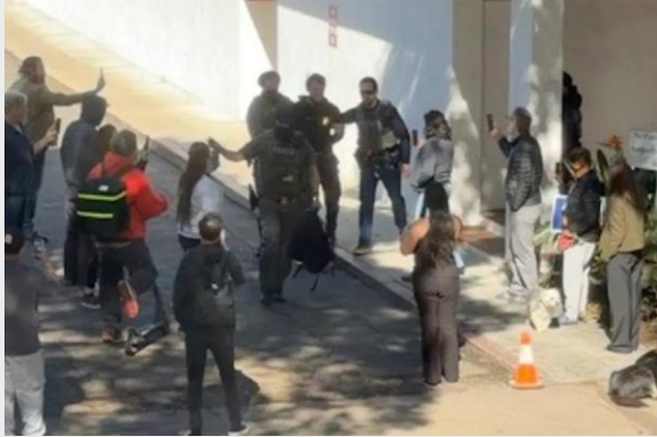
Federal agents outside the Santa Barbara County Probation building.