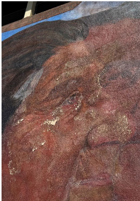
Detail of mural erosion on subject faces.