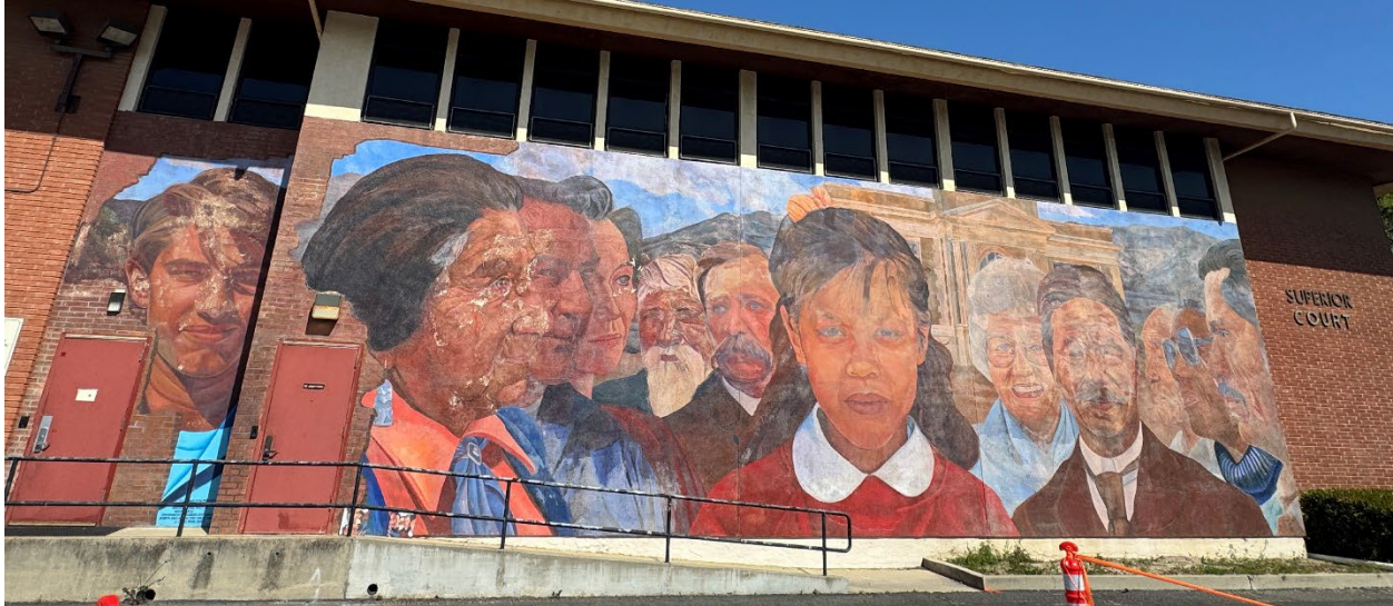
Photograph of the current state of the “People of Lompoc” mural by Richard Wyatt, Jr., on the Superior Court Building wall in Lompoc, Ca. The image has deteriorated and has flaking, paint loss, fading and blanching.