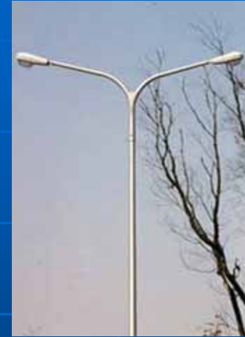
Example of double arm streetlight pole

Roadway improvements on El Colegio will add 18 new streetlights (double head poles)