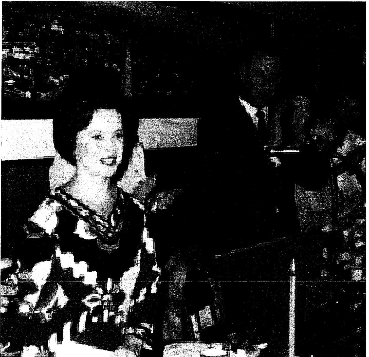
Shirley Temple Black is pictured with Don MacGillevray at Harry's Cafe 1968