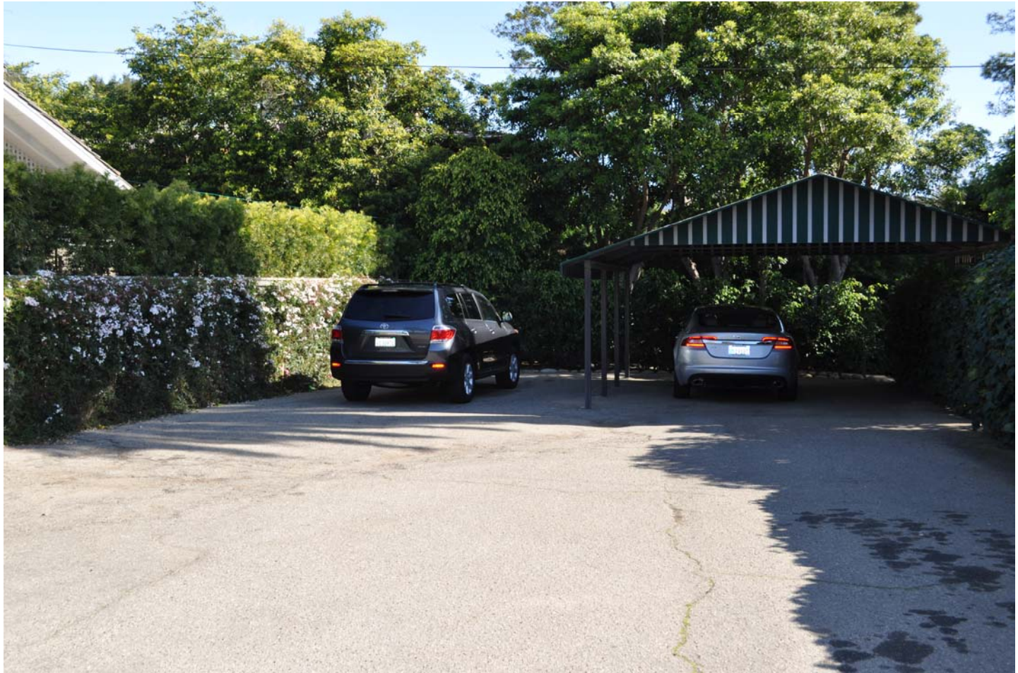
Looking from driveway to east