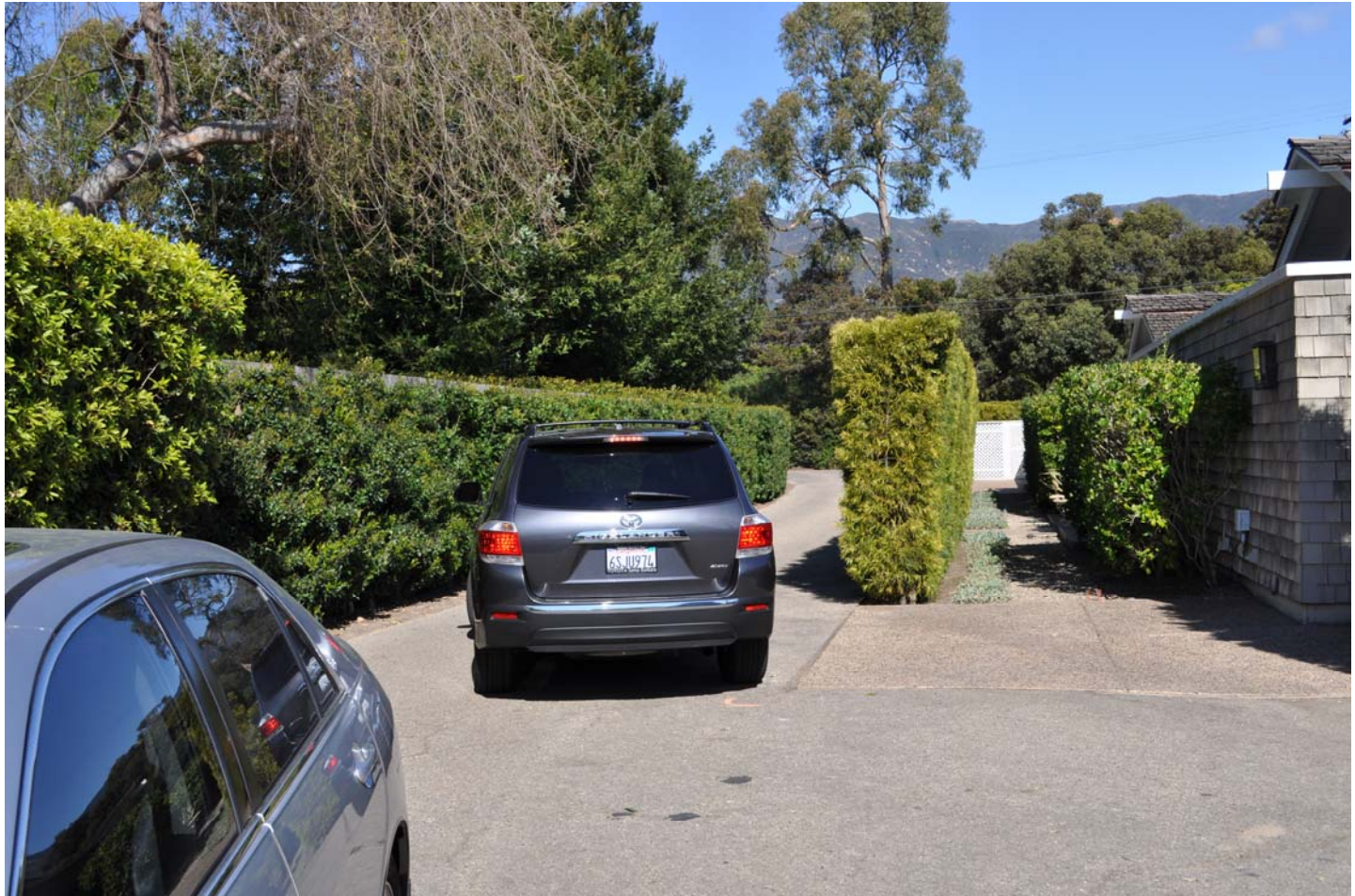
Exiting parking area