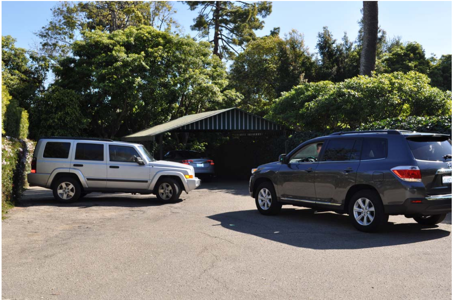
Looking from driveway to east