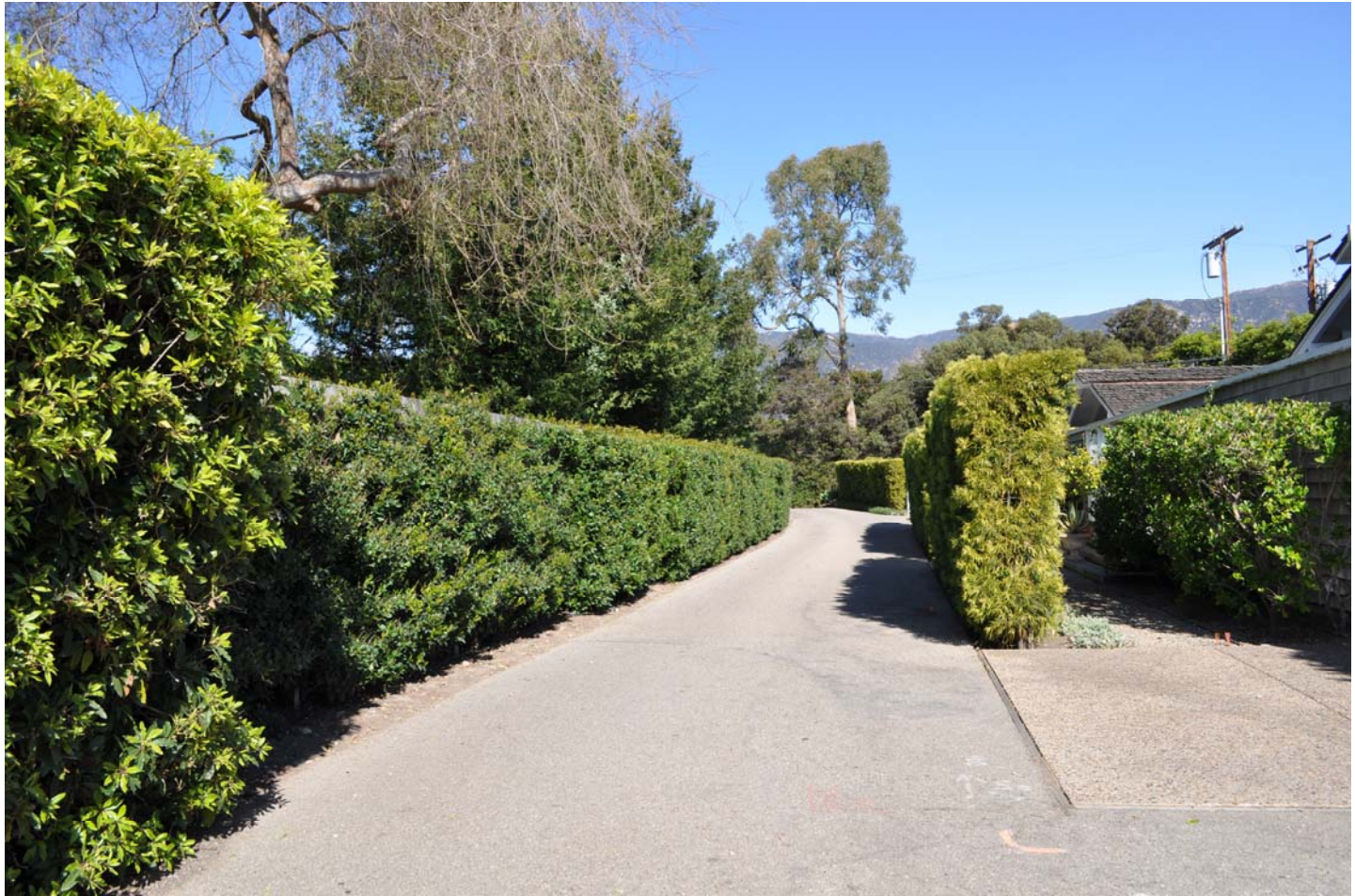
Looking from parking area to Fernald Point Lane