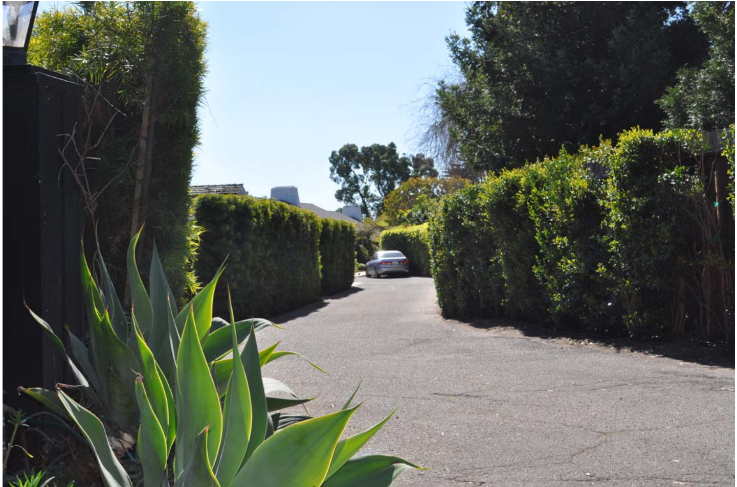
Looking from Fernald Point Lane toward residences