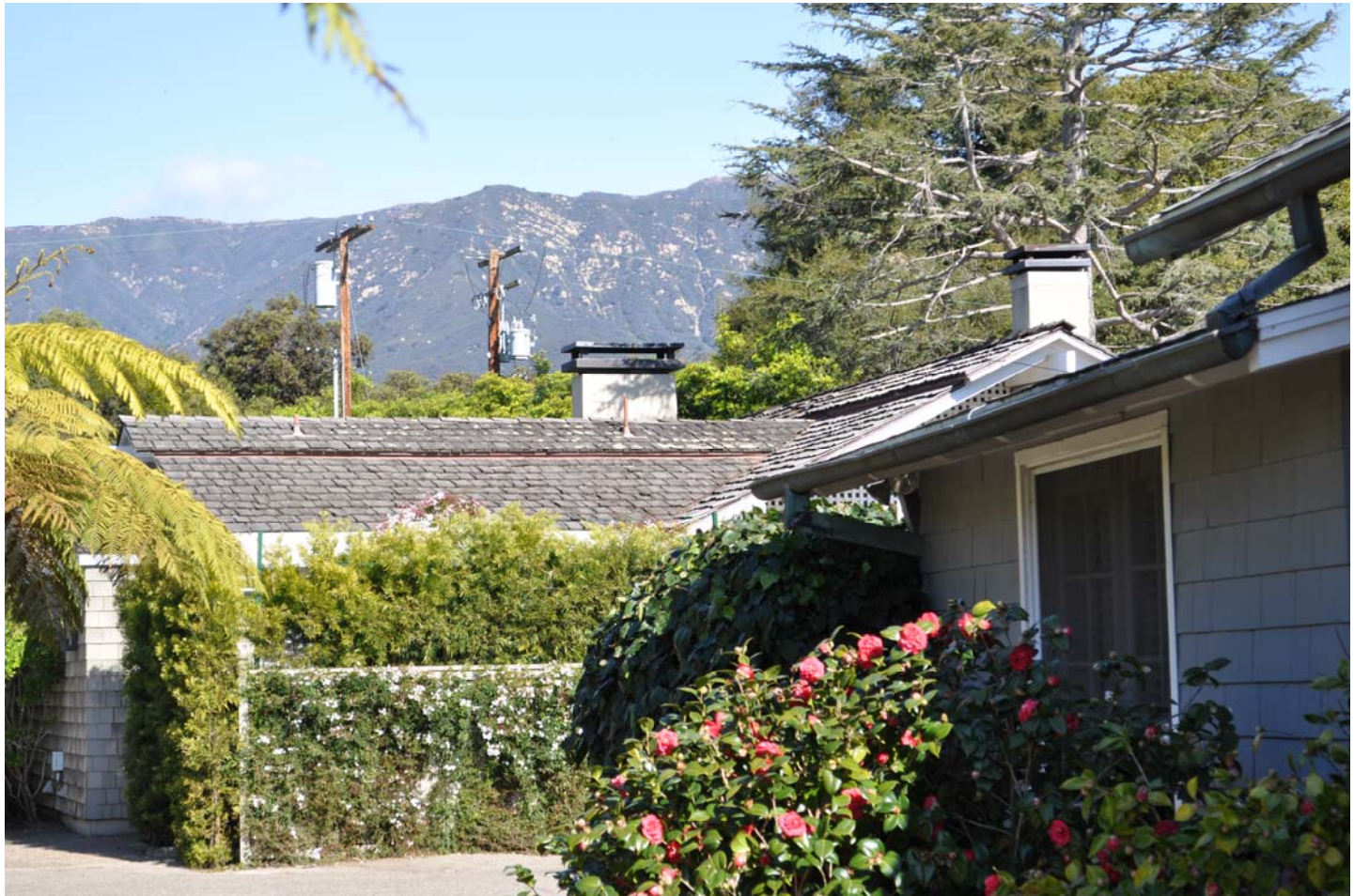
Mountain view from 1711 front walk