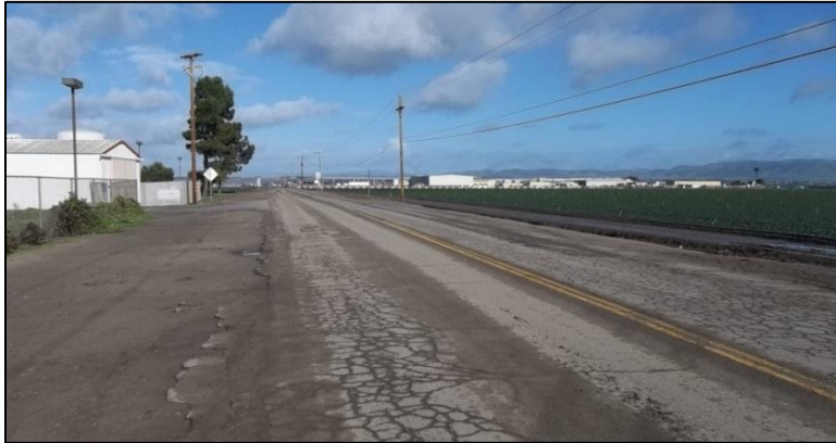
Typical Failed Areas on Bonita School Road

Your Board approved locations for Construction of FY 2012/2013 North County Repair Failed Areas in the First, Third, Fourth & Fifth Supervisorial Districts on June 19, 2012, in the FY 2012/2013 Road Maintenance Annual Plan (RdMAP).