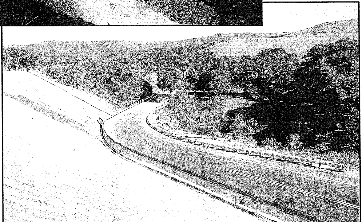
Jalama Road Three Days Prior to Project Completion