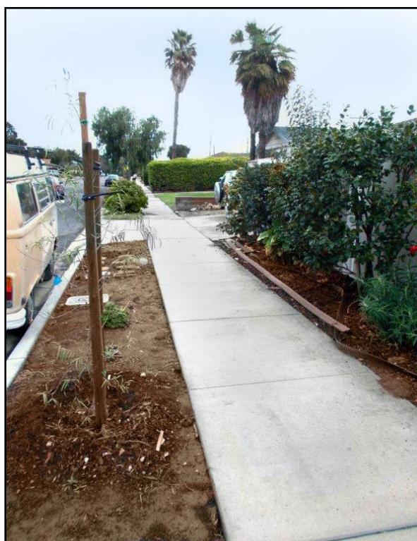
Location at 5089 San Simeon Dr. after the repair