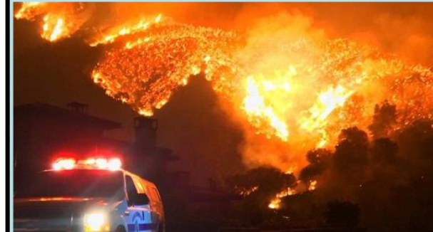
Thomas, Whittier, Alamo, Sherpa, Rey Fires