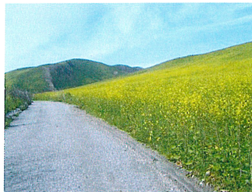
Figure 2- Portion of the Historic Pavement

This pavement is the original historic pavement of the US 101 predecessor. It starts near the project north of the freeway and continues for about 0.35 mile just short of the newly revamped curve on US 101. The pavement is in generally good shape, in spite of its age. The original road edgings and a few roadside features still exist. There are still other short segments of the original route south and east of the freeway.