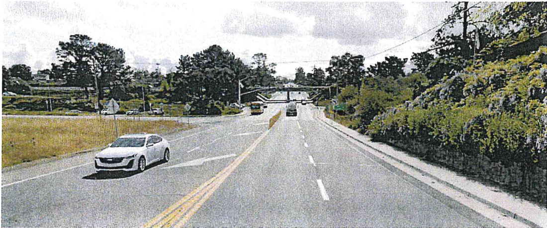
Figure 1: Clark Avenue, Orcutt CA: at the intersection with Norris Street, looking east (existing channelizers and merge lane)