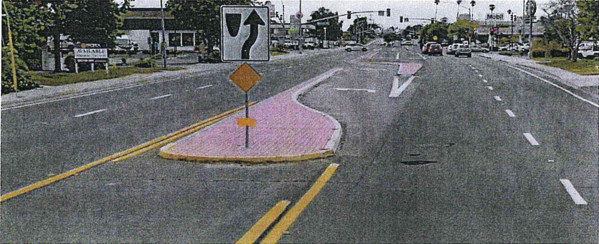
Figure 3: Example of a concrete raised median with a left turn pocket