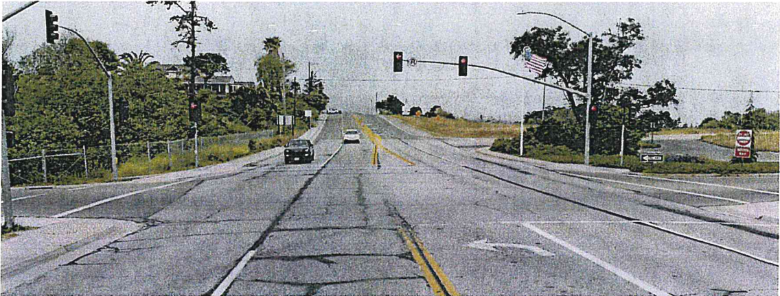
Figure 2: Clark Avenue (Intersection with State Route 135 southbound off ramp and State Route 135 southbound on ramp), looking west