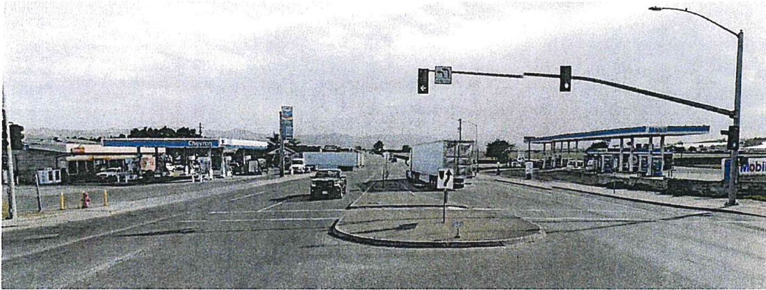
Figure 4: Example of a Pedestrian Refugee Island at an intersection

Name of Public Agency Approving Project: County of Santa Barbara