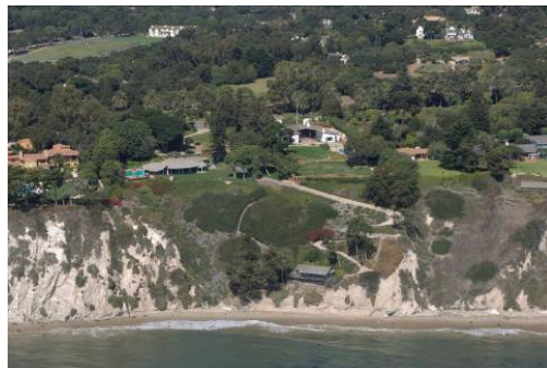
Aerial View (2008)