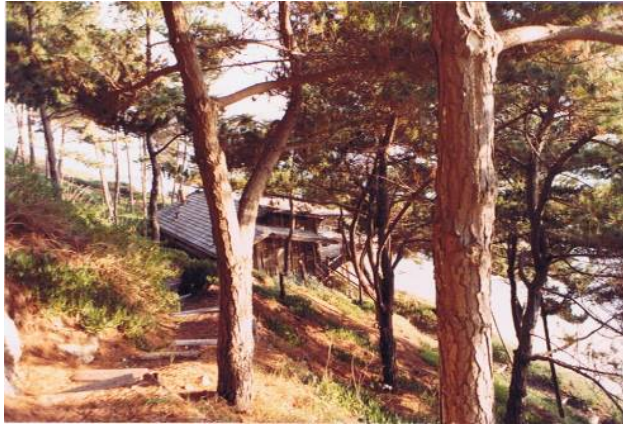
Exterior view – Circa 1983 (Likely appearance at time of Construction in 1956)