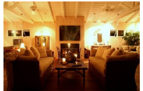
Interior View (May, 2010)