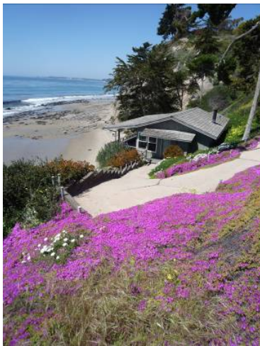
Exterior View (May, 2010)