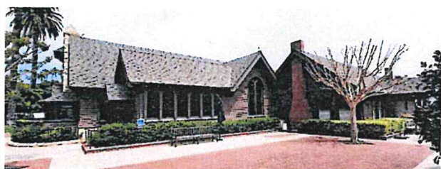
South elevation, view northeast.