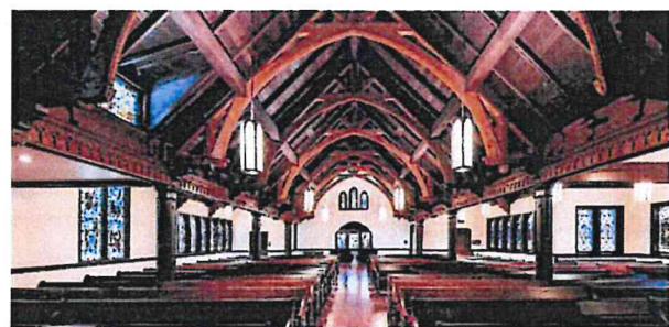
Interior, altar with wood trusses and stained-glass windows.