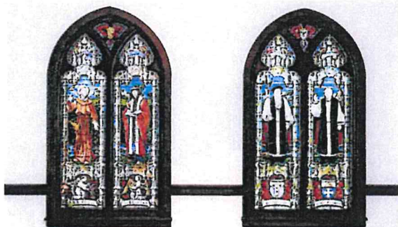
Interior, stained-glass windows.