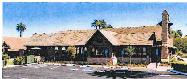
North elevation, view south.