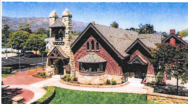
Primary (west) elevation on Eucalyptus Lane, view northeast.