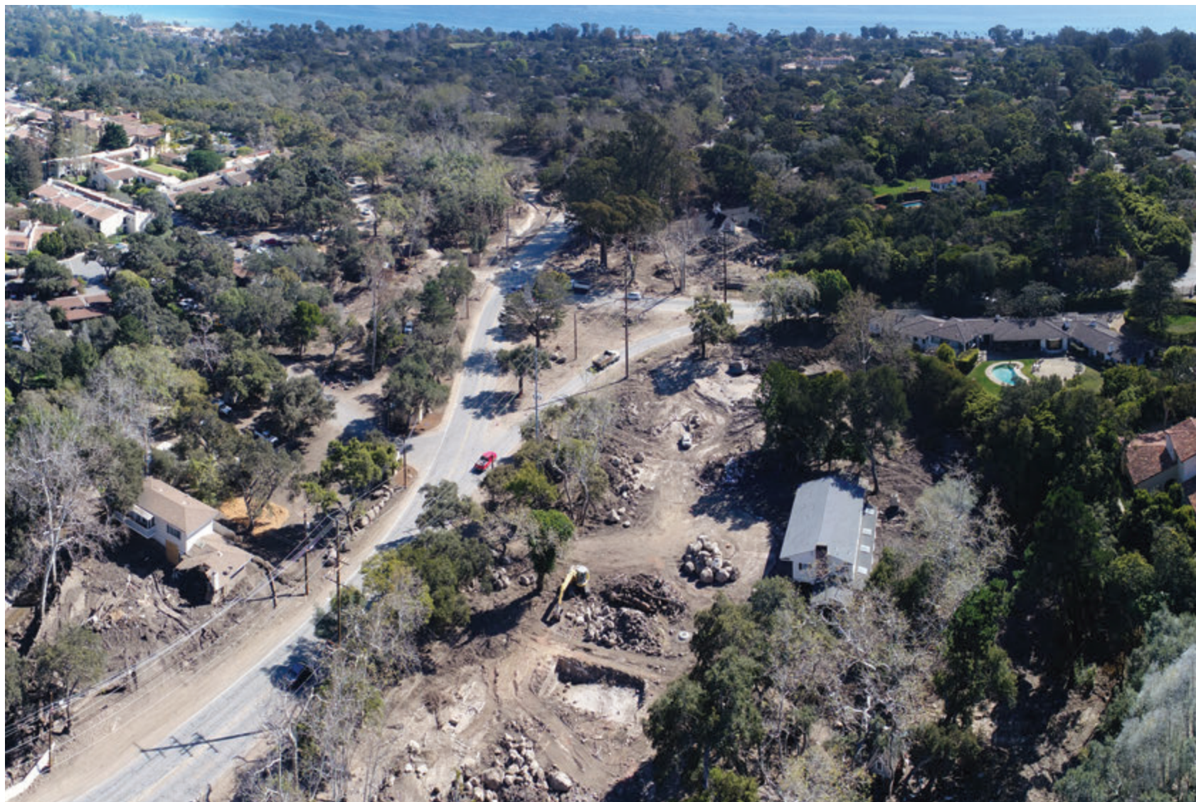
Olive Mill and Hot Springs Road. February 28, 2018.