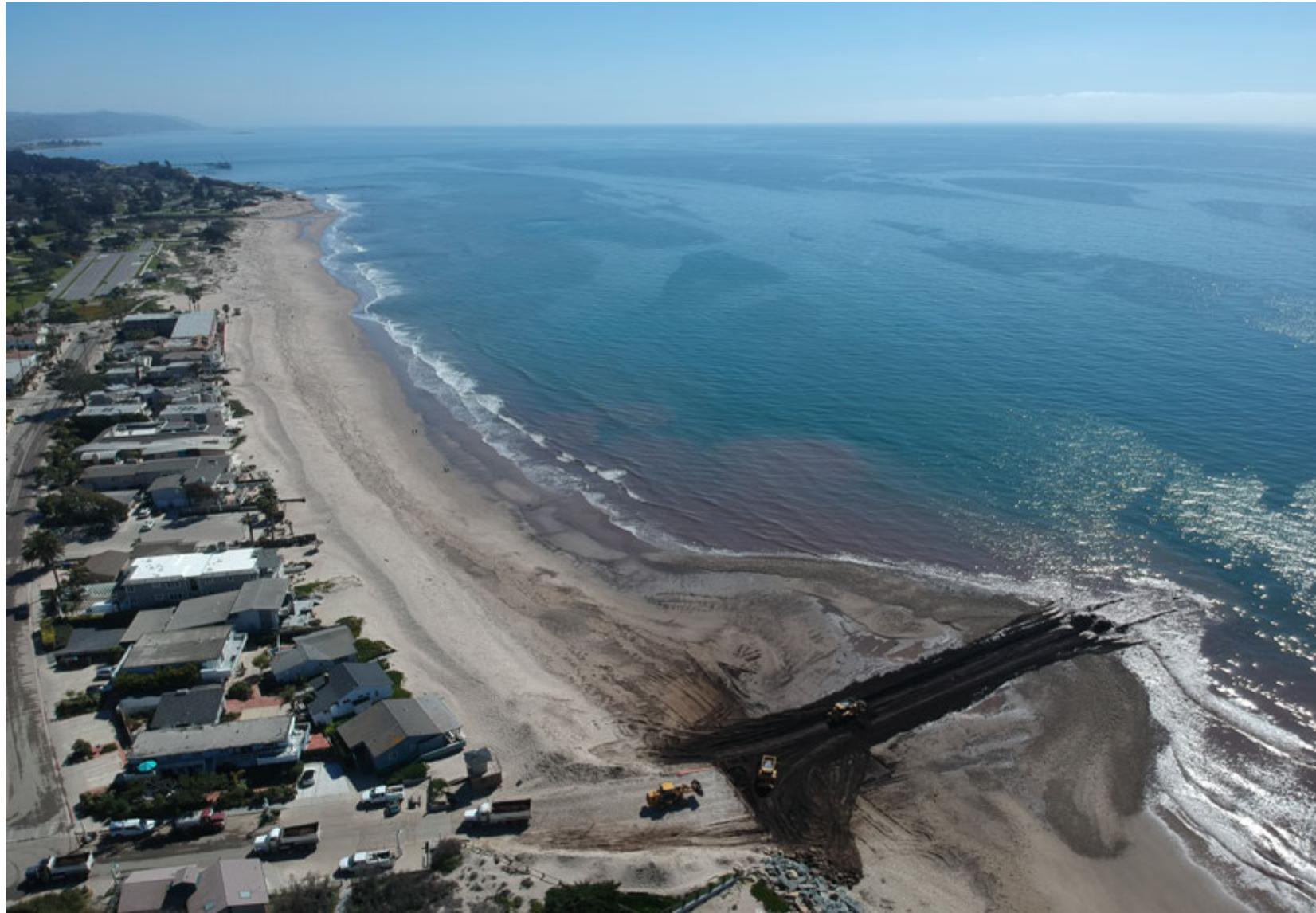
Sediment placement on Carpinteria State Beach at Ash Avenue. February 25, 2019.