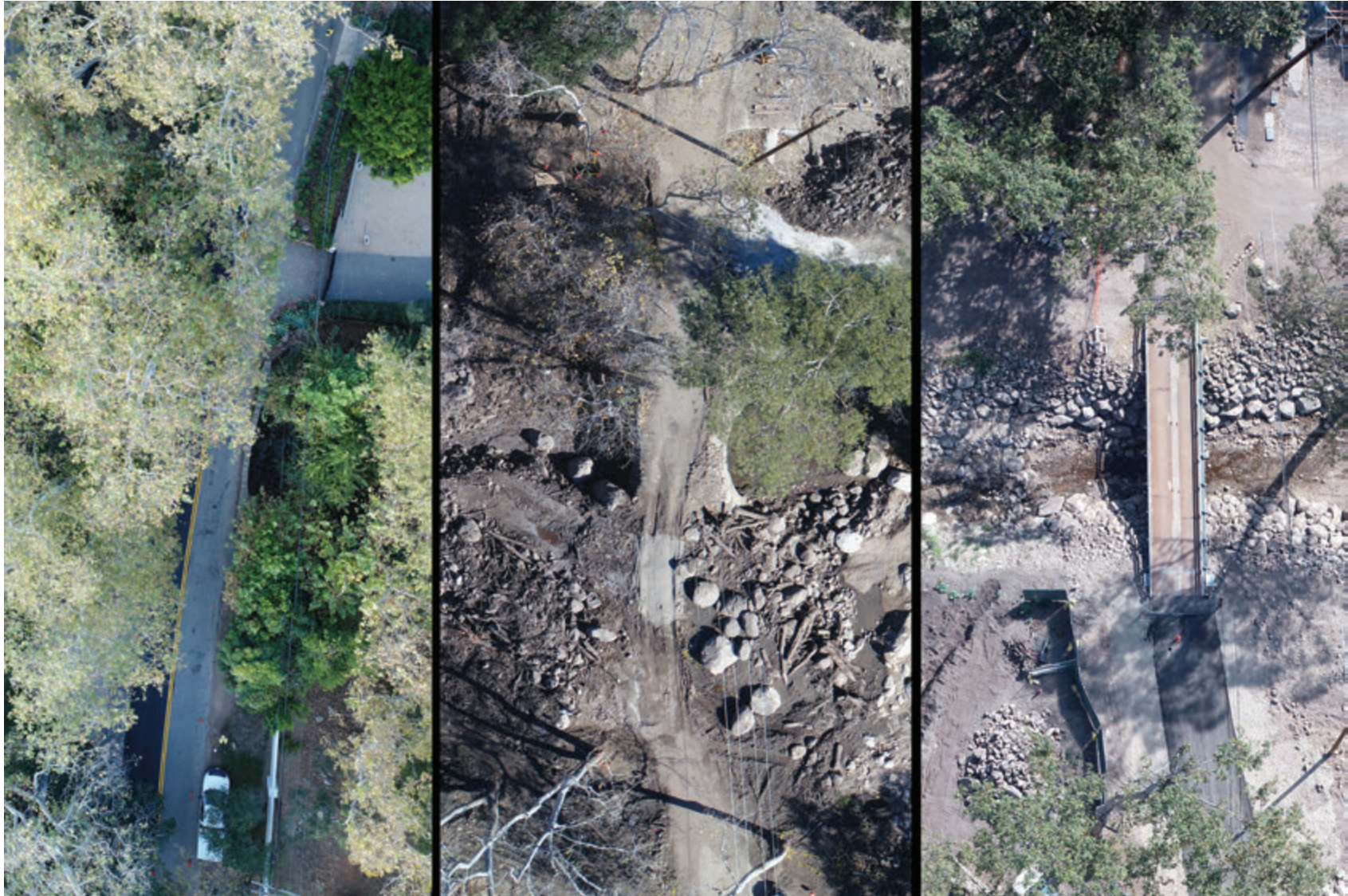
The Ashley Road bridge site two months before, two weeks after, and five months after the 1/9 Debris Flow.