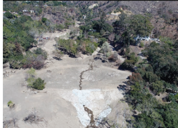
Left: The Santa Monica Debris Basin four months before and one month after the 1/9 Debris Flow. Right: The Cold Springs Debris Basin on January 15, 2018 and February 26, 2018.