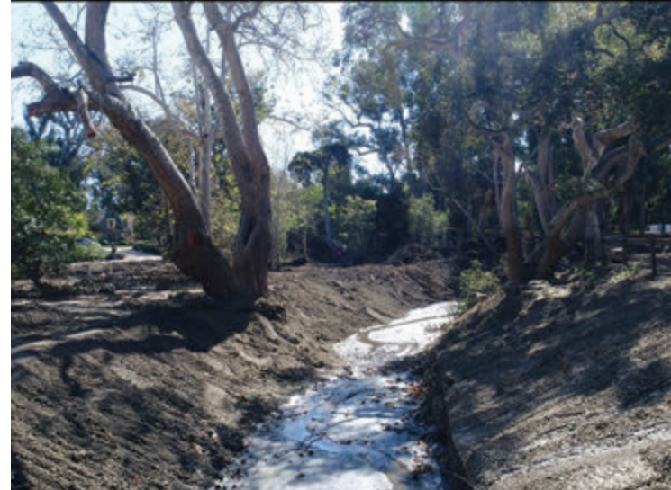
Left: The Ashley Road Bridge two months before and two weeks after the 1/9 Debris Flow. Right: Romero Creek at Sheffield Road on February 5, 2018 and February 28, 2018.