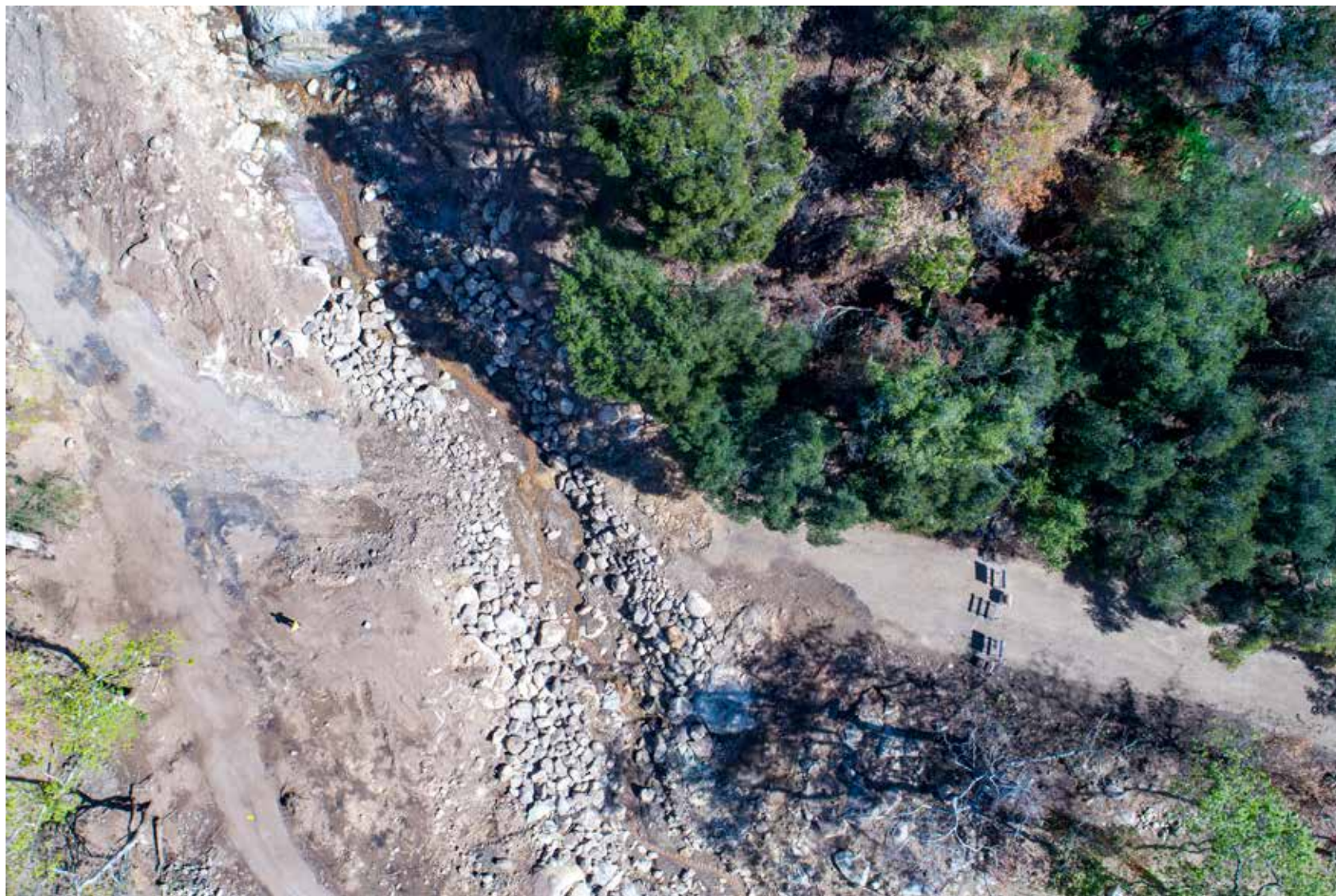
Washed out road. Cold Springs Trail low water crossing, June 28, 2018.