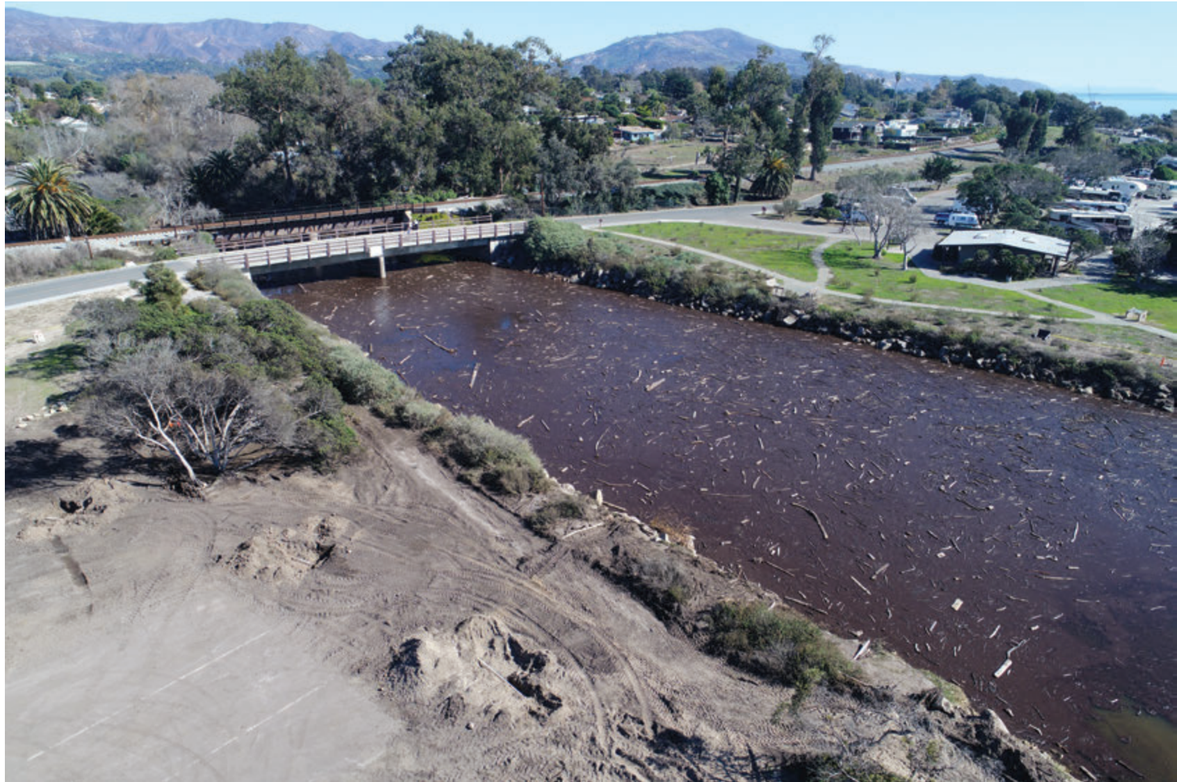
Carpinteria Creek at Carpinteria State Beach. January 28, 2018.