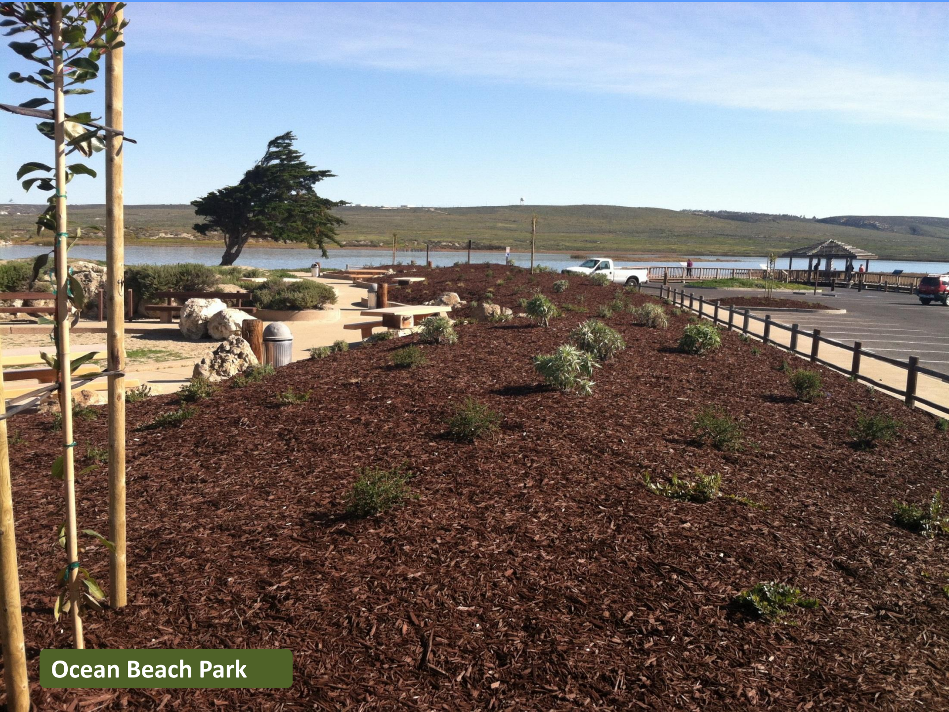
Ocean Beach Park