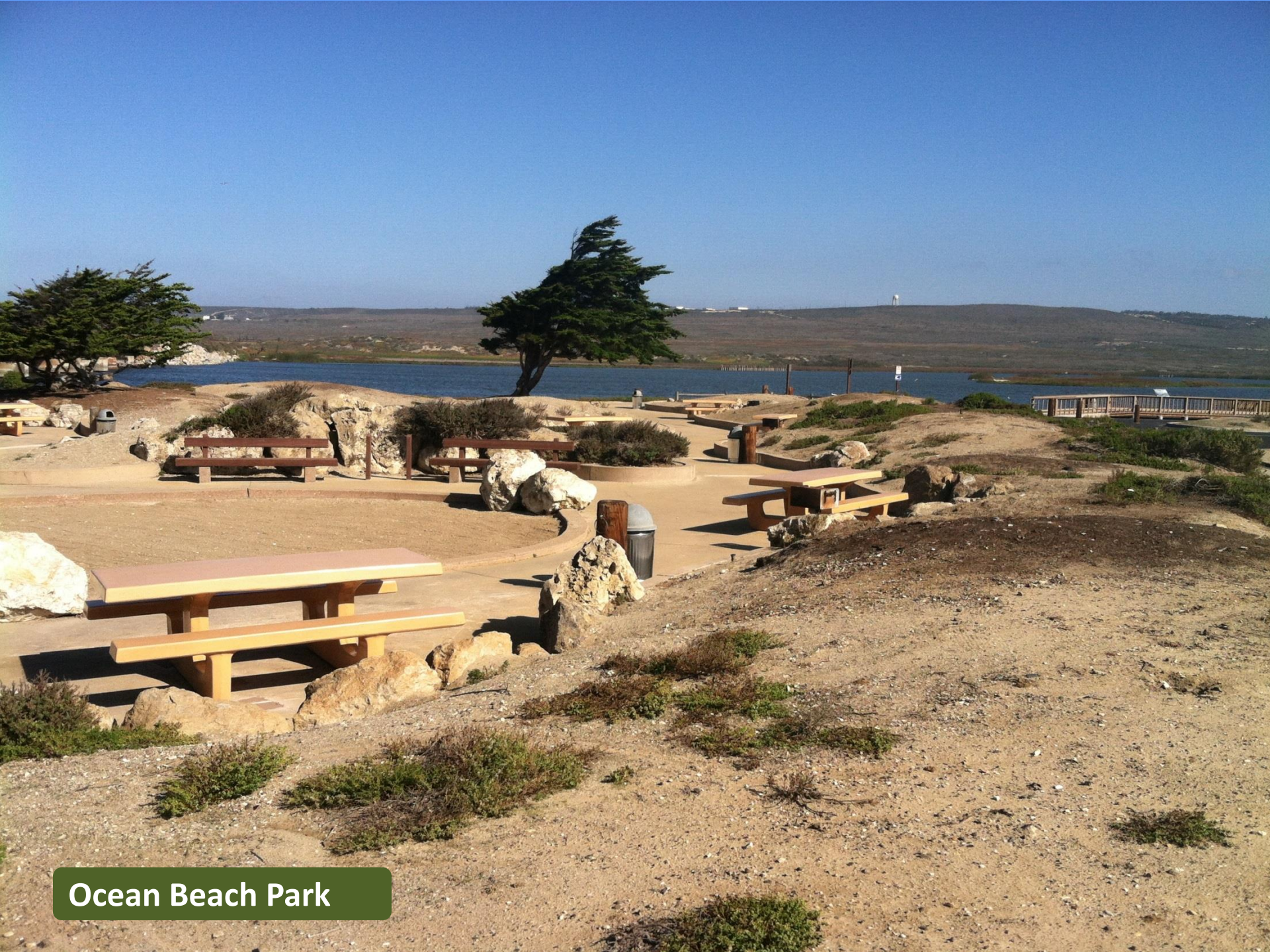
Ocean Beach Park