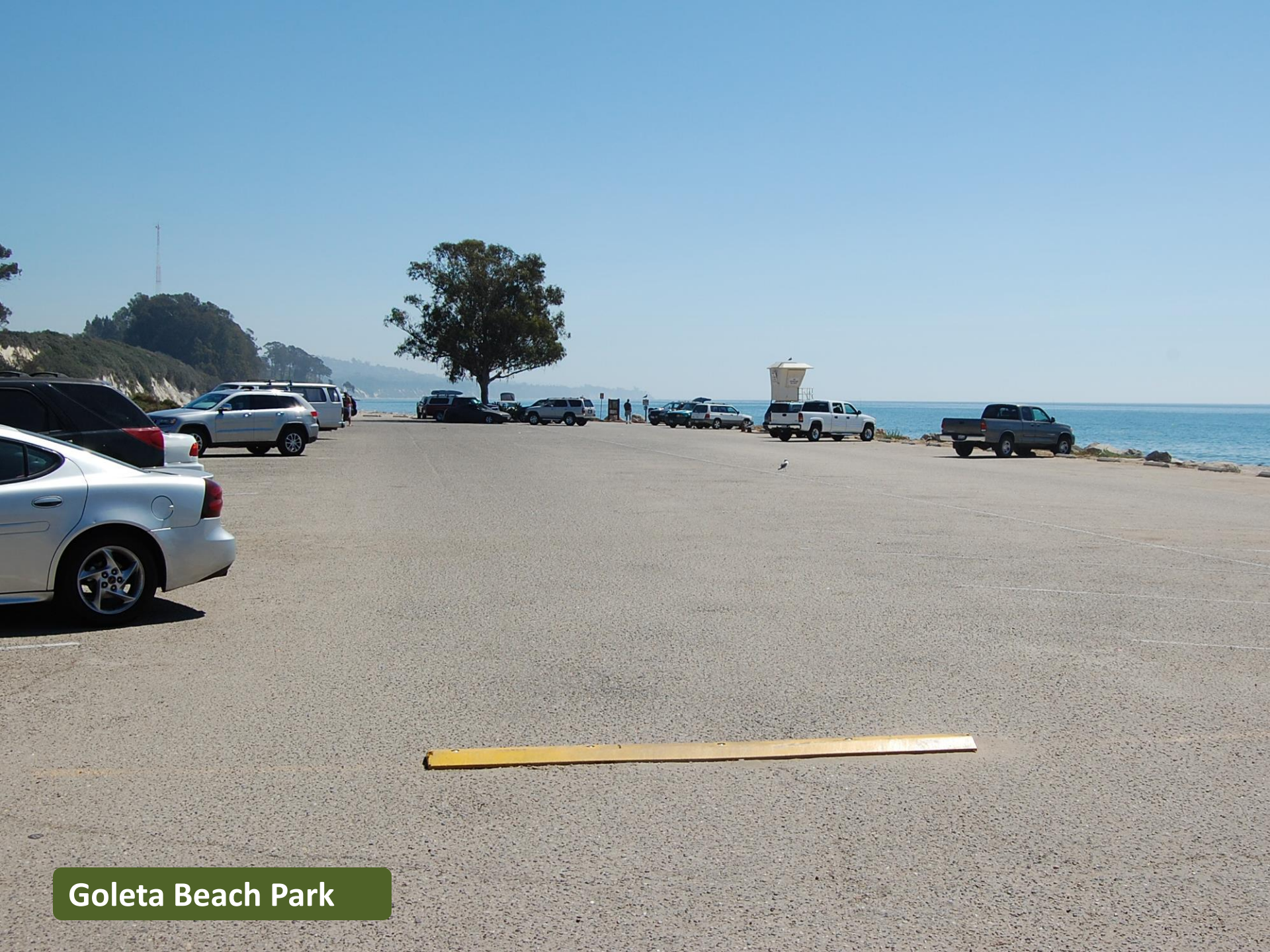
Goleta Beach Park