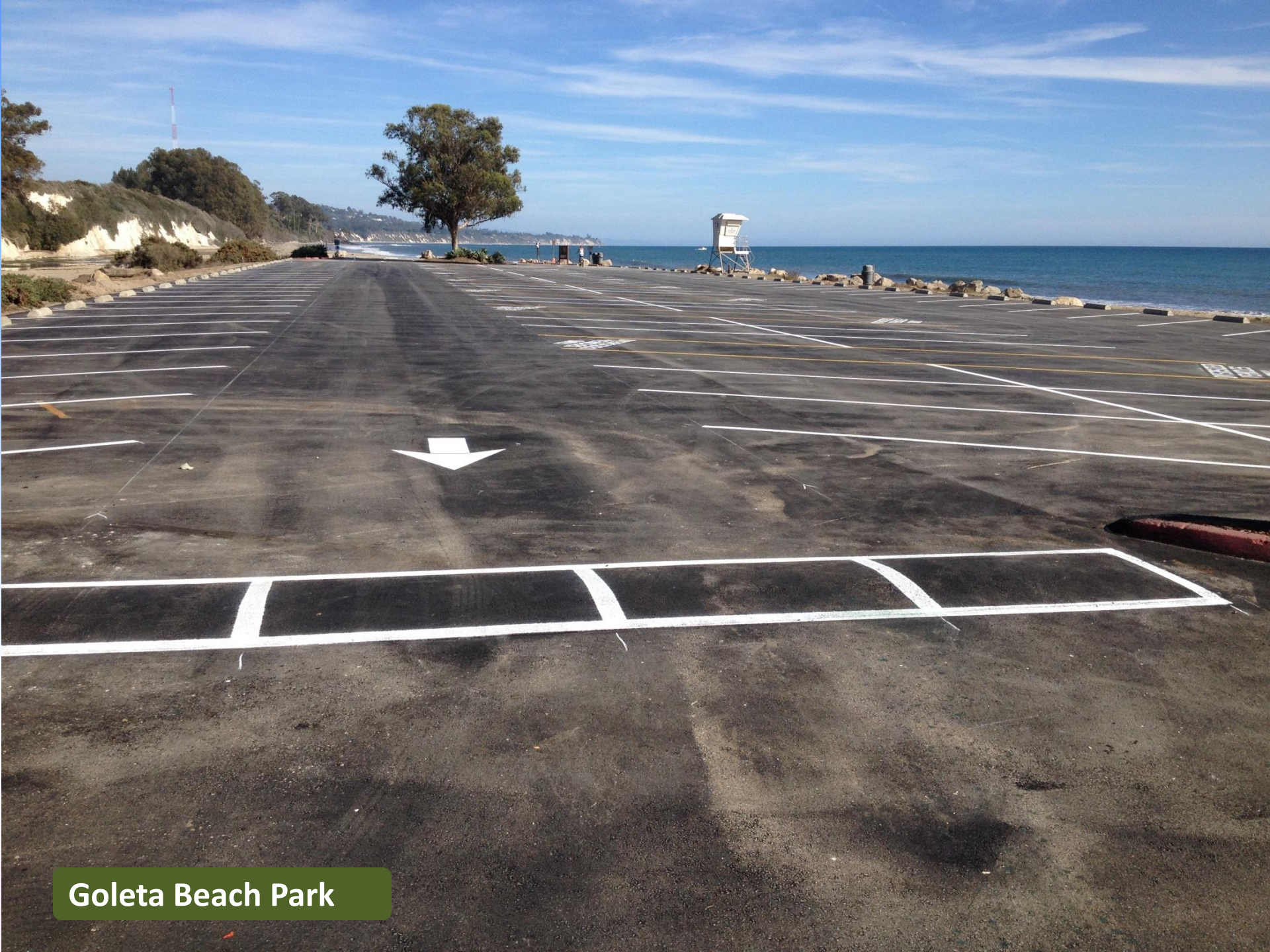
Goleta Beach Park