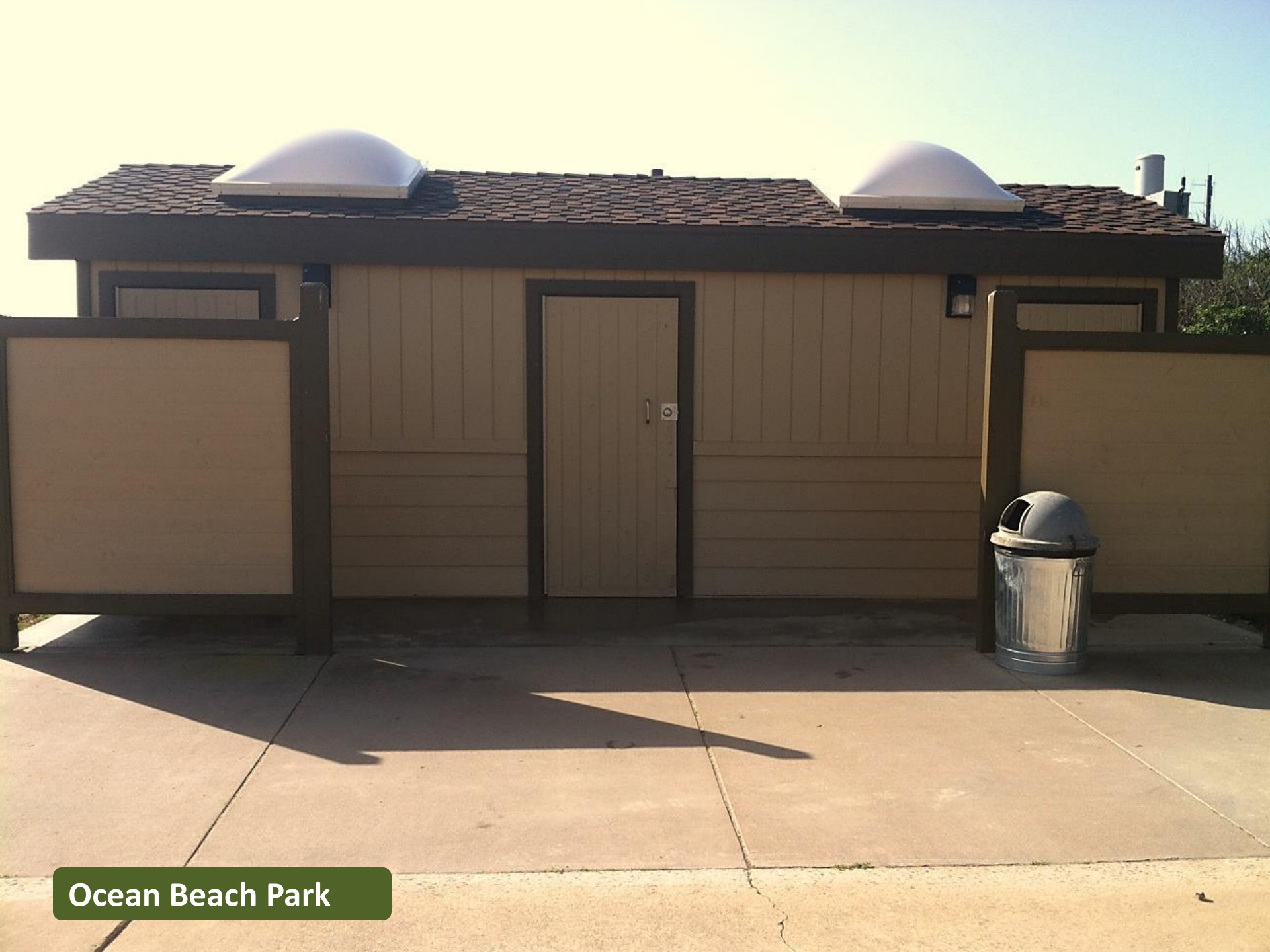
Ocean Beach Park