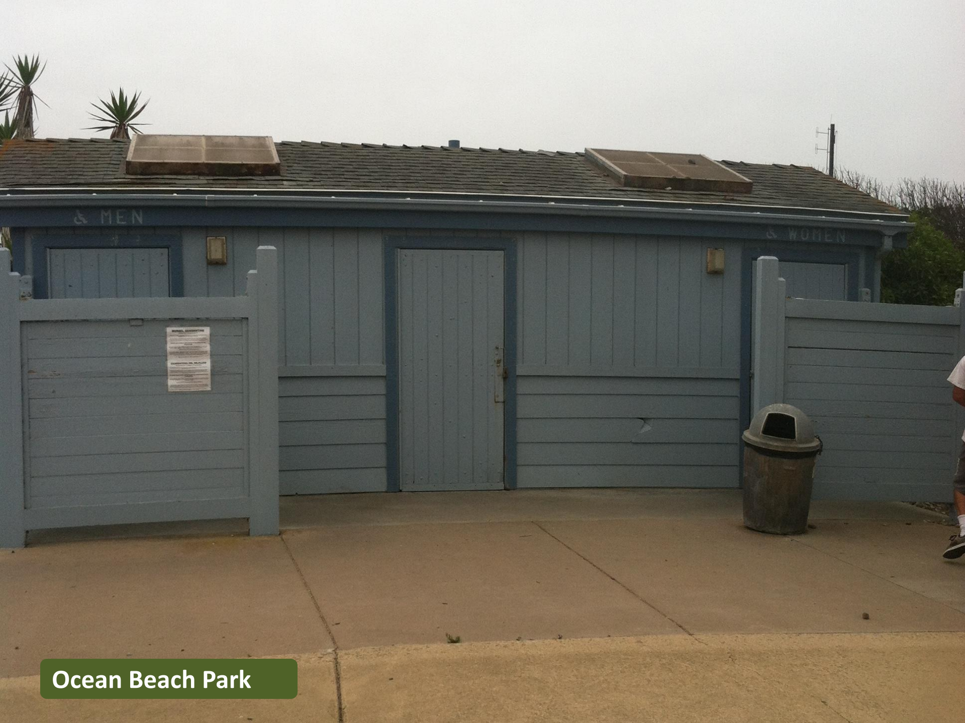
Ocean Beach Park