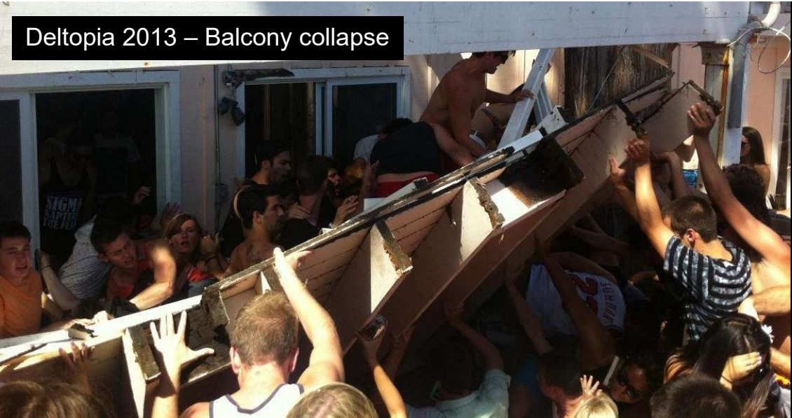
Deltopia 2013 – Balcony collapse