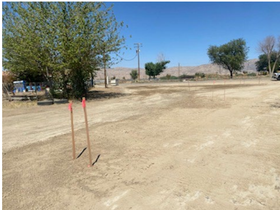
Completed Fire Access Road