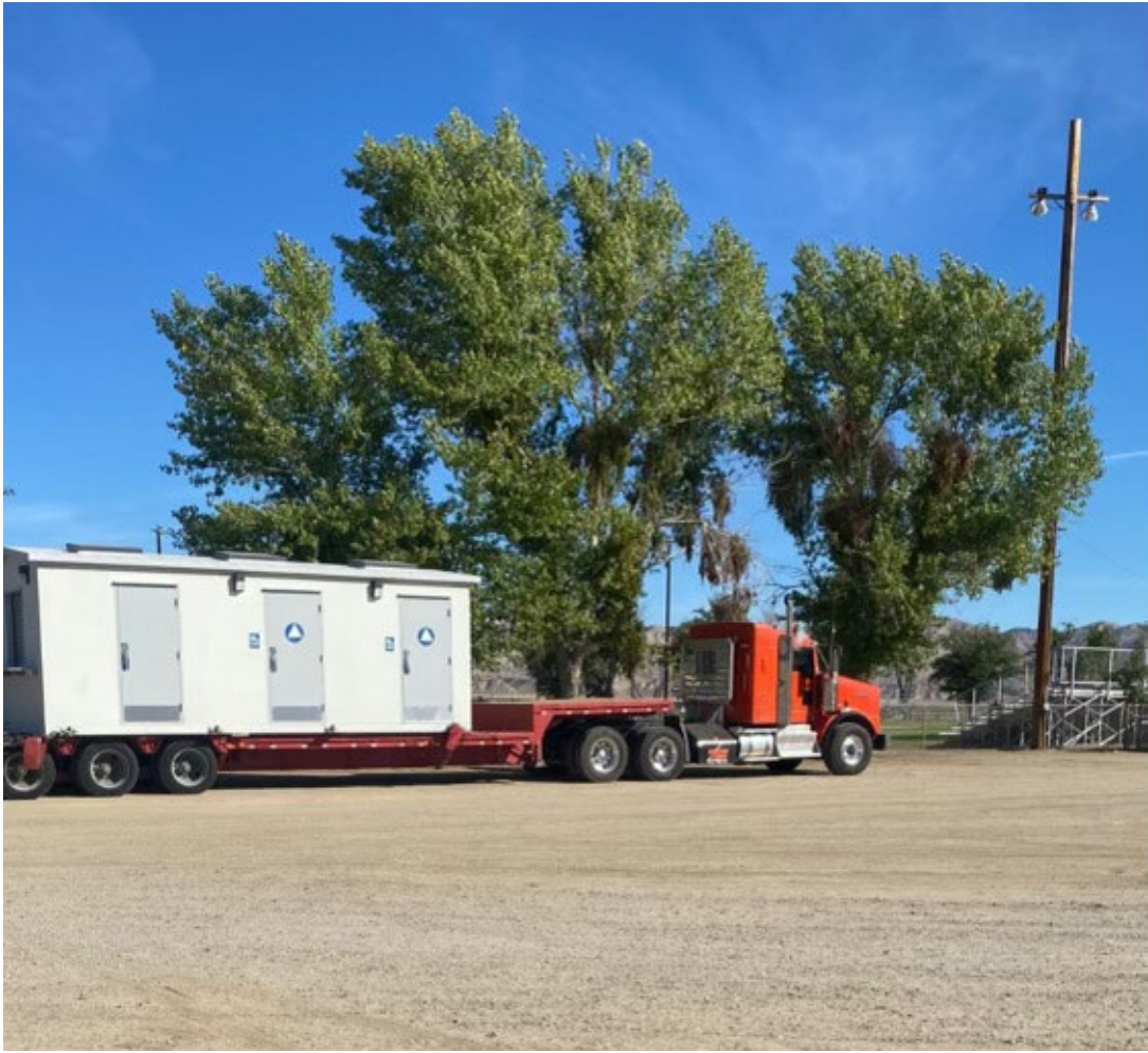
Unit Delivery 9/29/22