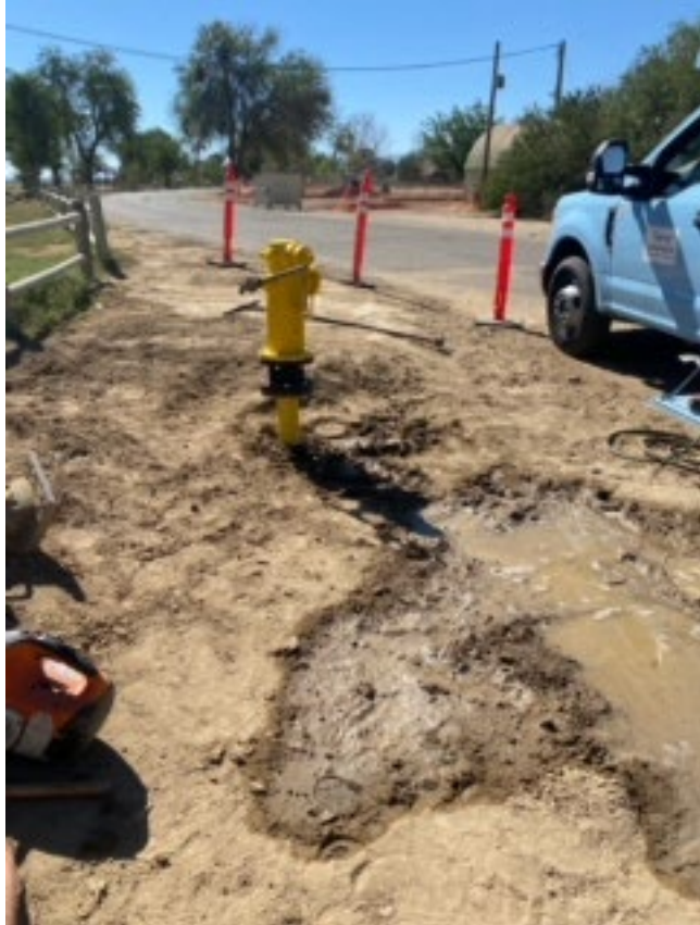
Utility Work on Hydrant Upgrade and Sewer Tie In