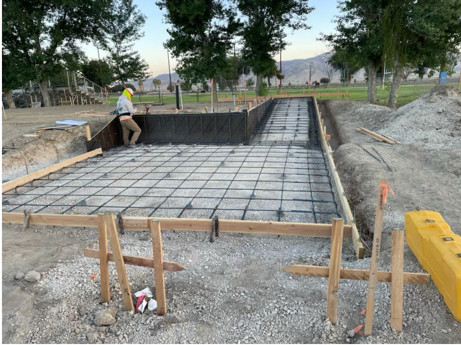
Over excavation and Foundation Work