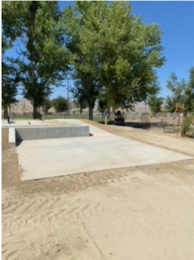
Completed Building Pad/Foundation