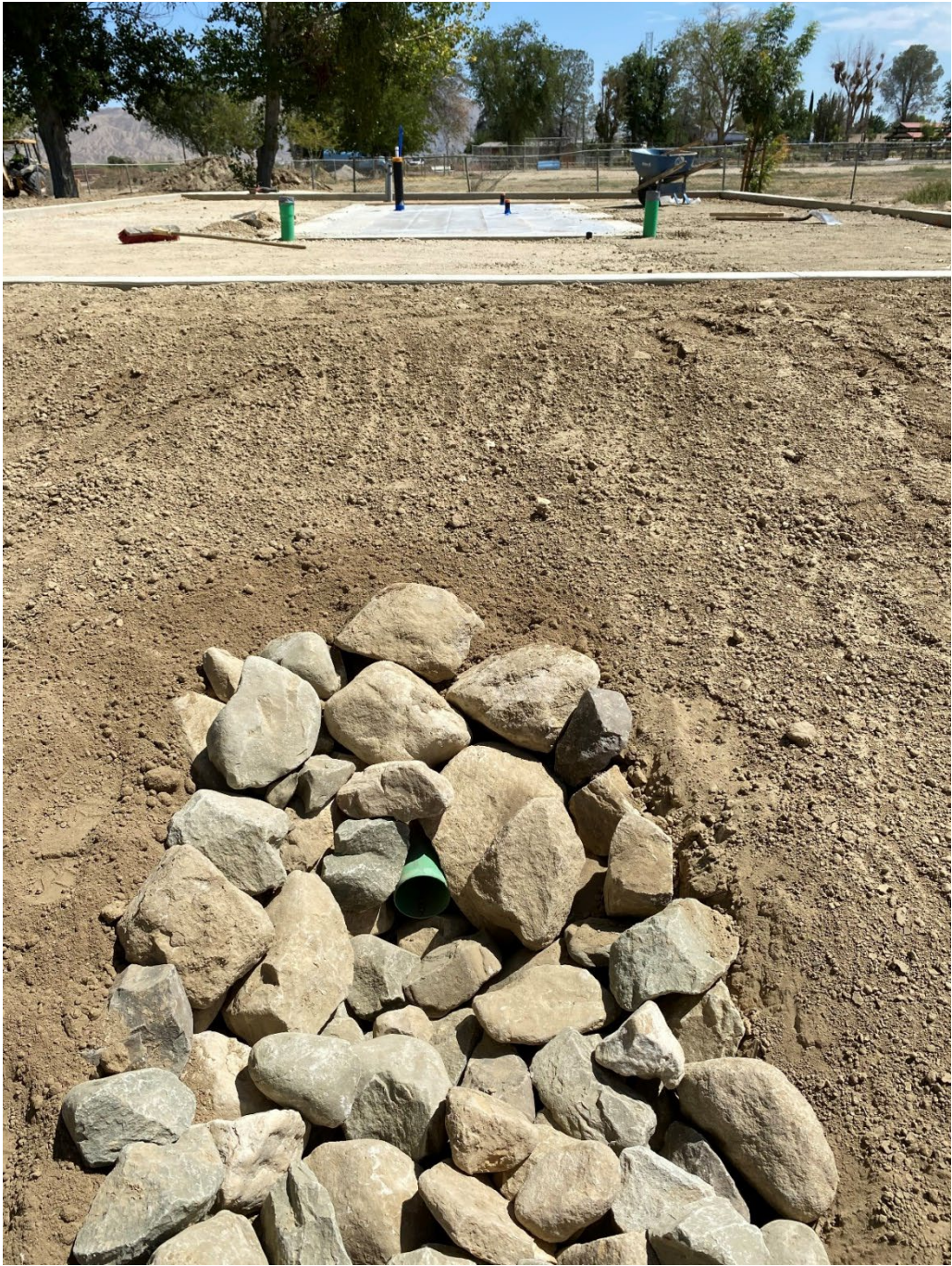
Building Pad with Drainage