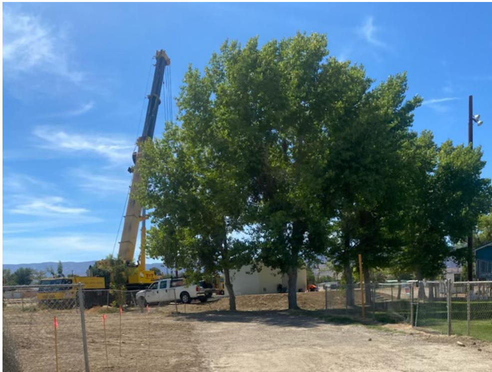
Unit Placement Completed 9/29/22