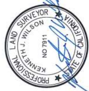
EXHIBIT B STORM DRAIN EASEMENT LOT 17 - TRACT No. 14,585 APN 059-020-057 COUNTY OF SANTA BARBARA STATE OF CALIFORNIA

COURSE TABLE C1 - Δ = 0° 19' 00" R = 1960.15 L = 10.83' L2 - S 89° 25' 43" W 13.12' L3 - N 3° 49' 36" E 12.44' C4 - Δ = 5° 14' 57" R = 214.00 L = 19.61' L5 - S 37° 53' 18" E 54.70' L6 - N 88° 24' 54" W 22.51'