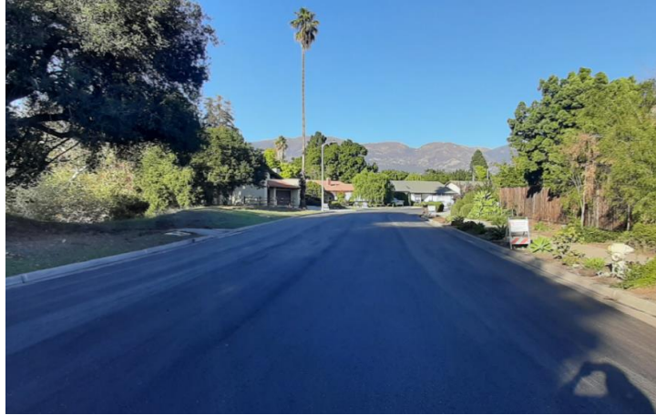
Figure 1: 2021-2021 Countywide Pavement Rehabilitation and Fog Sealing

This project is part of the FY 2020-21 Road Maintenance Annual Plan (RdMAP). The project locations are countywide and included rehabilitation of approximately 12 lane miles of pavement and fog sealing of approximately 20 lane miles. A Notice of Exemption for the FY 2020-21 RdMAP was filed on August 18, 2020, and the proposed action is within the scope of the Notice of Exemption.