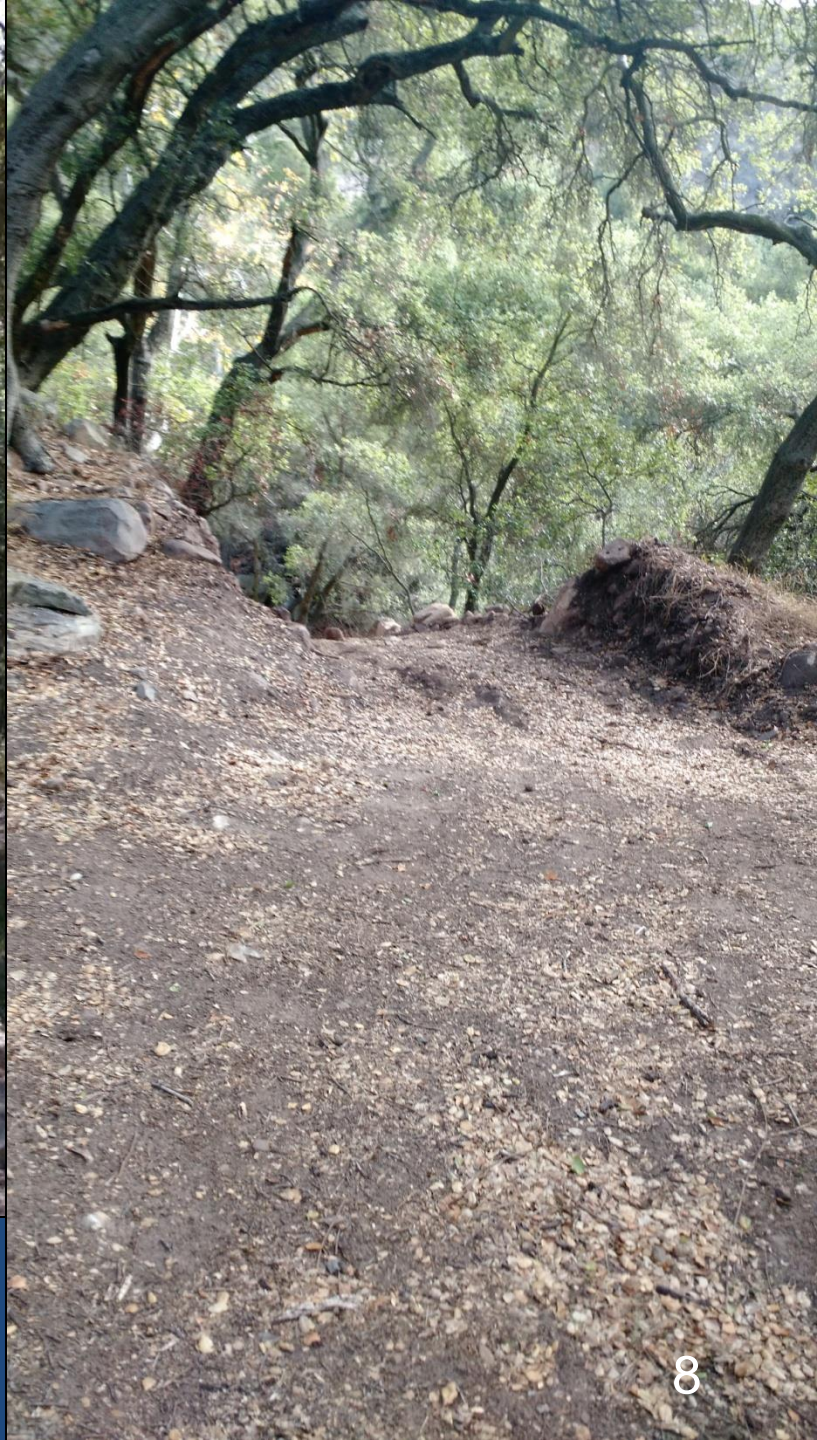
Site Visit 2015 (right)