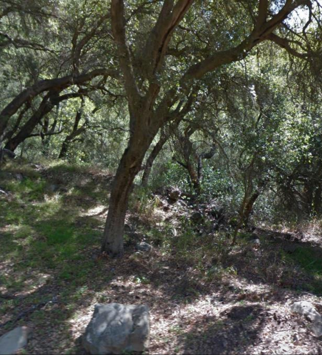
Google Streetview 2012 (above)