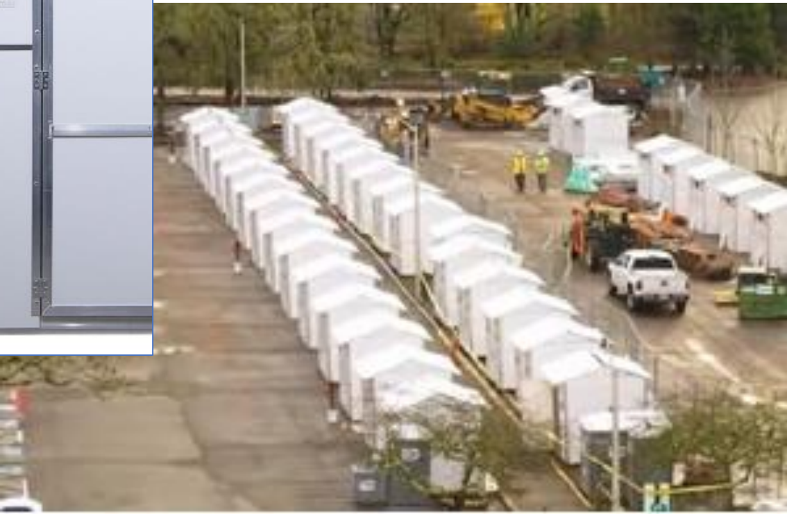
Reusable Pallet Shelters Riverside, Redondo Beach, Solano County

Shelters can be individually stacked for low-cost warehousing or shipping. Each panel is light enough to be carried by hand.