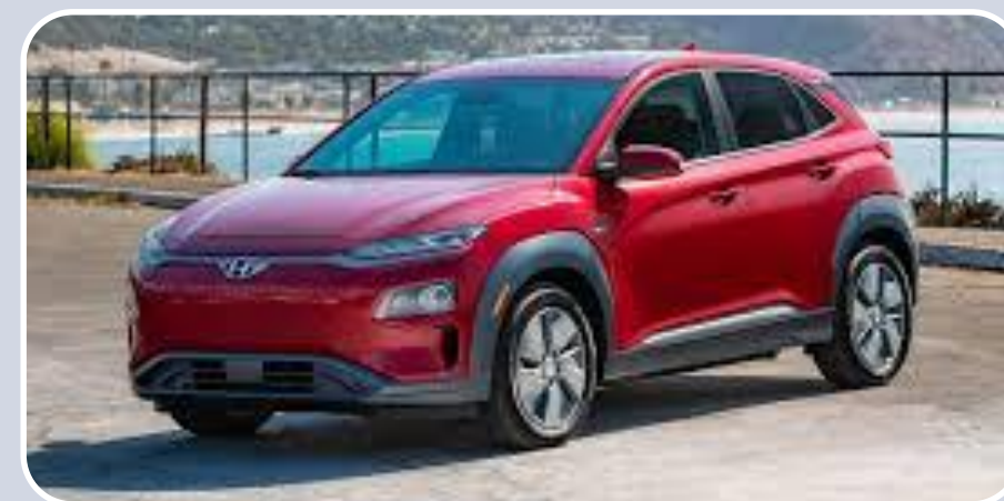
Hyundai Kona Electric