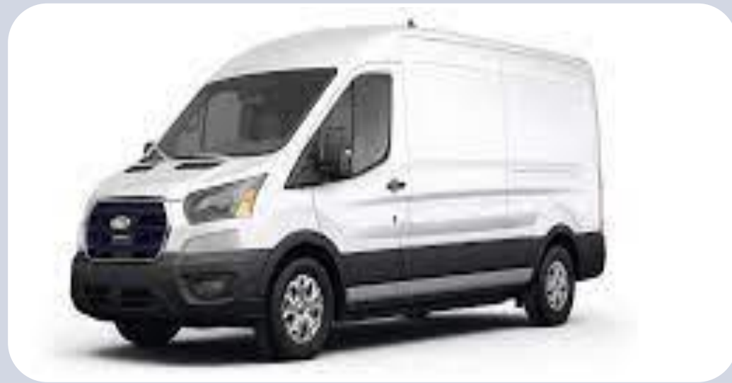
Ford E-Transit (Delivery: 2023)