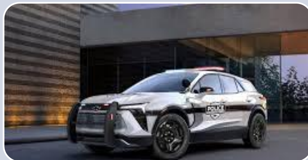
Chevrolet Blazer EV (Expected: 2024)