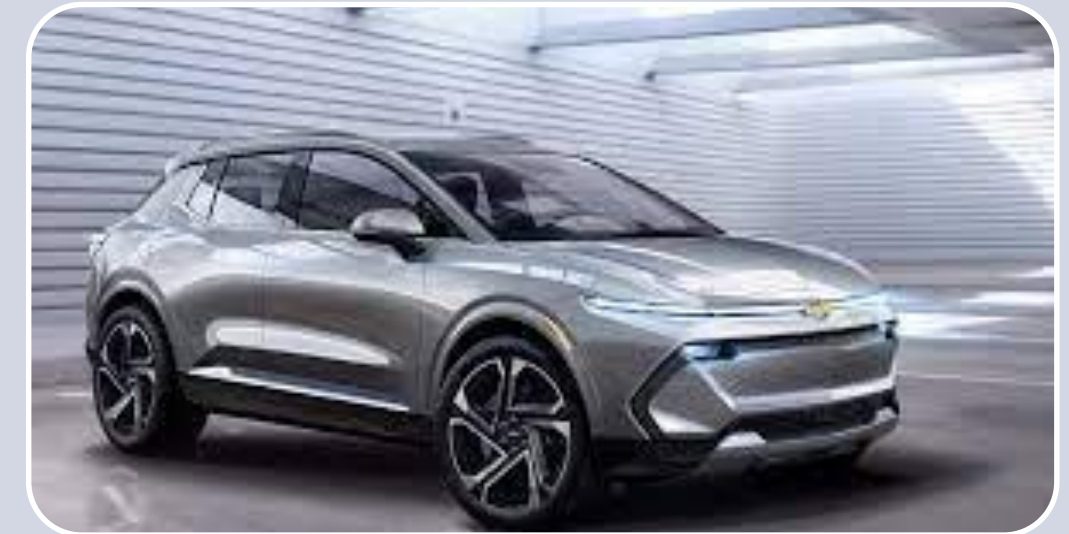
Chevrolet Equinox EV (Expected: Late 2023)