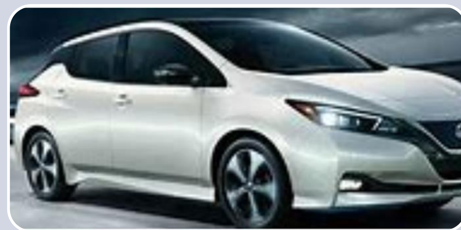
Nissan Leaf (30 on order for the fleet)