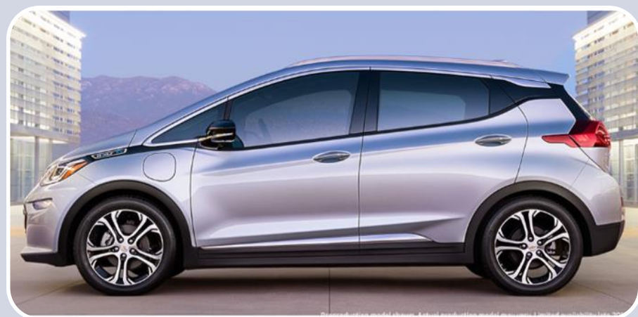
Chevy Bolt (60 currently in the fleet)