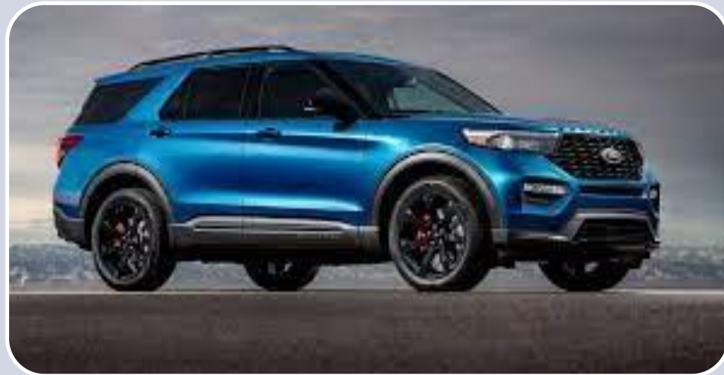
Ford Explorer EV (Expected: 2025)