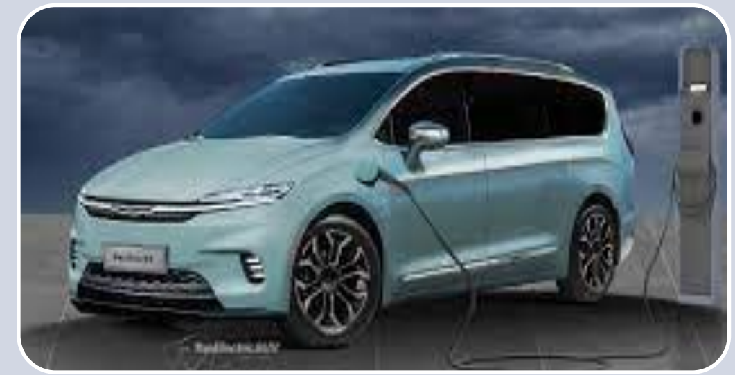
Chrysler Pacifica Electric (Expected: 2025)