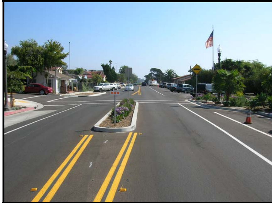
Figure 1: Summerland Circulation and Parking Improvements Project.

contract amount of $172,275.00, authorized by your Board on April 17, 2007, is sufficient to complete the Detailed Design of the entire Phase 2 project (2A and 2B).