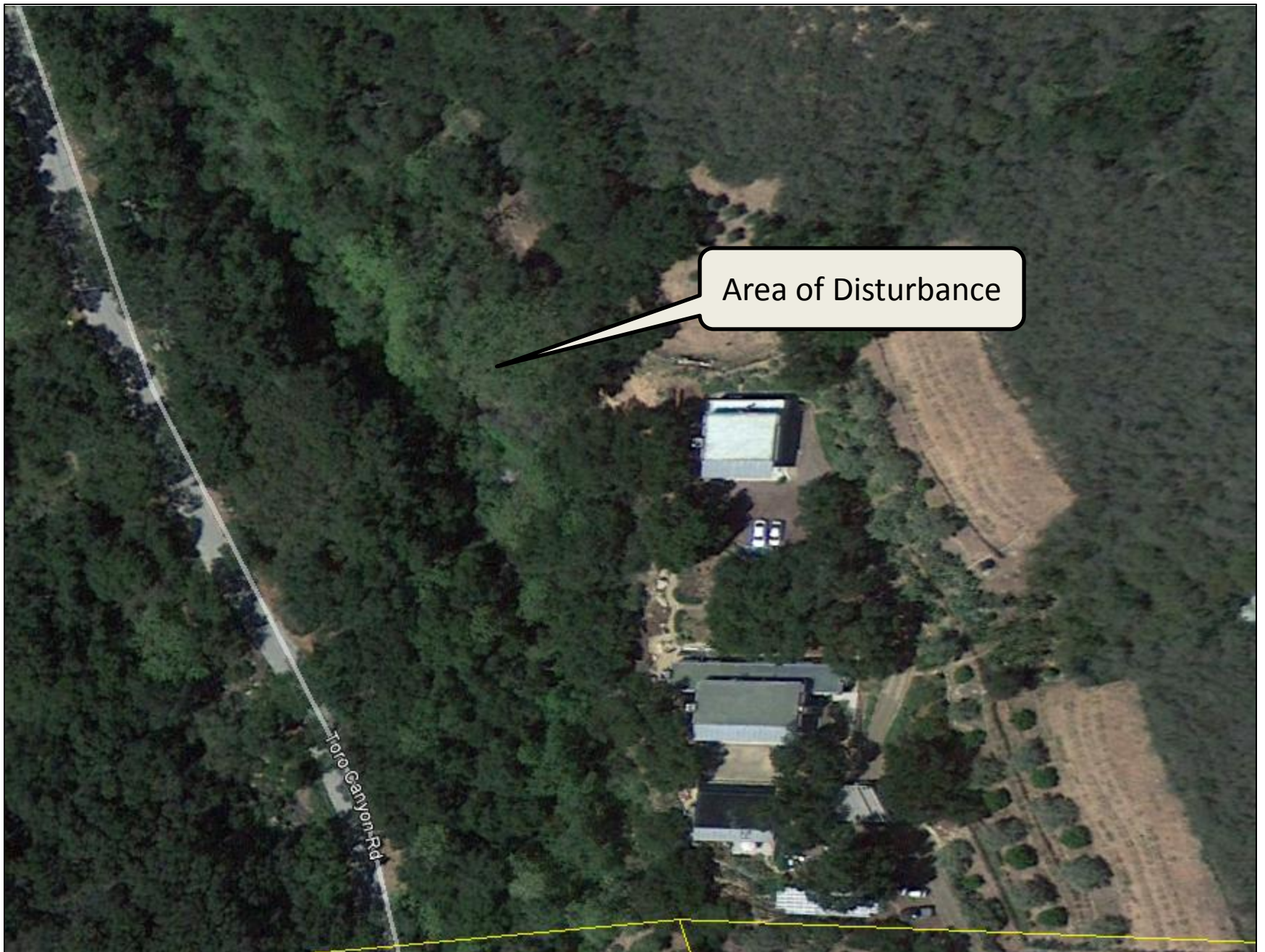
Figure 7.c: Photo of area pre-disturbance in April 2013.