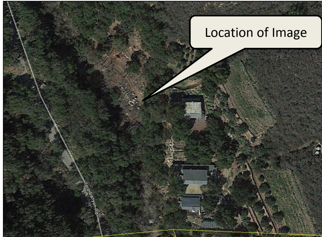
Figure 14: Photo of area of disturbance