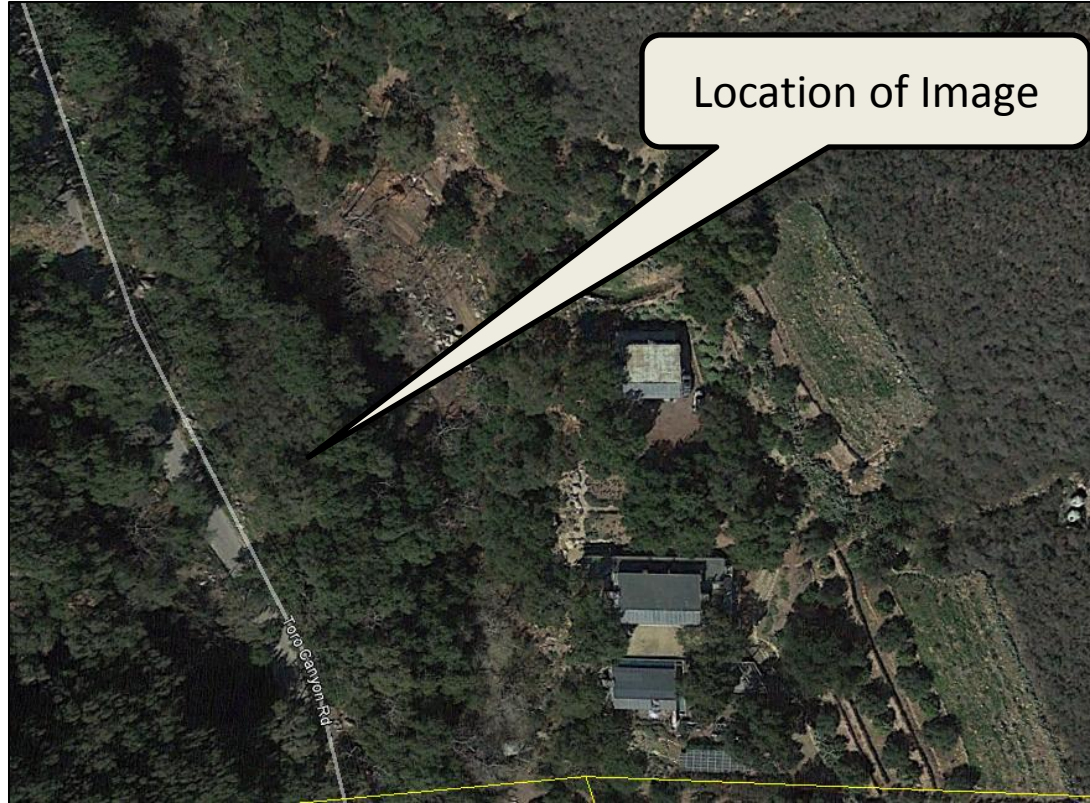
Figure 11: Photo of area of disturbance