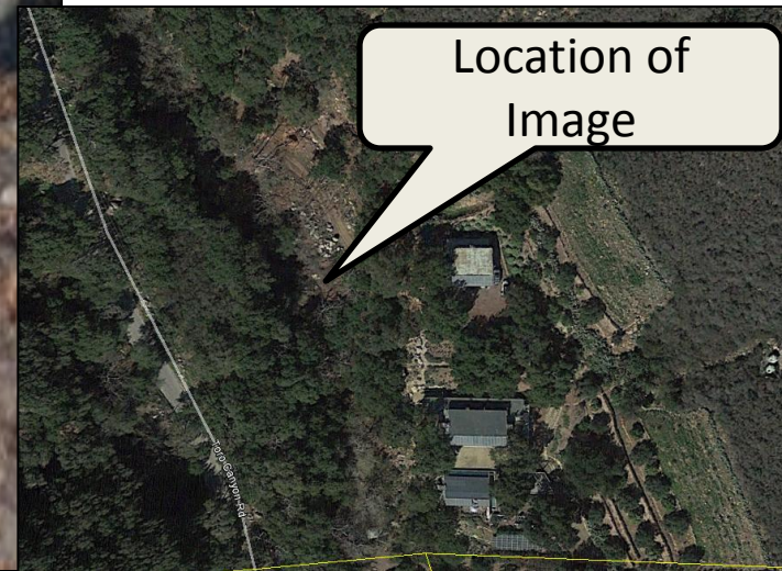
Figure 12: Photo of boulders placed within Toro Canyon Creek