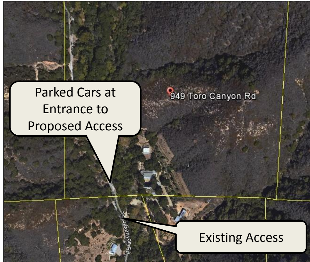
Figure 2: Entrance of proposed access as viewed from entrance to existing access