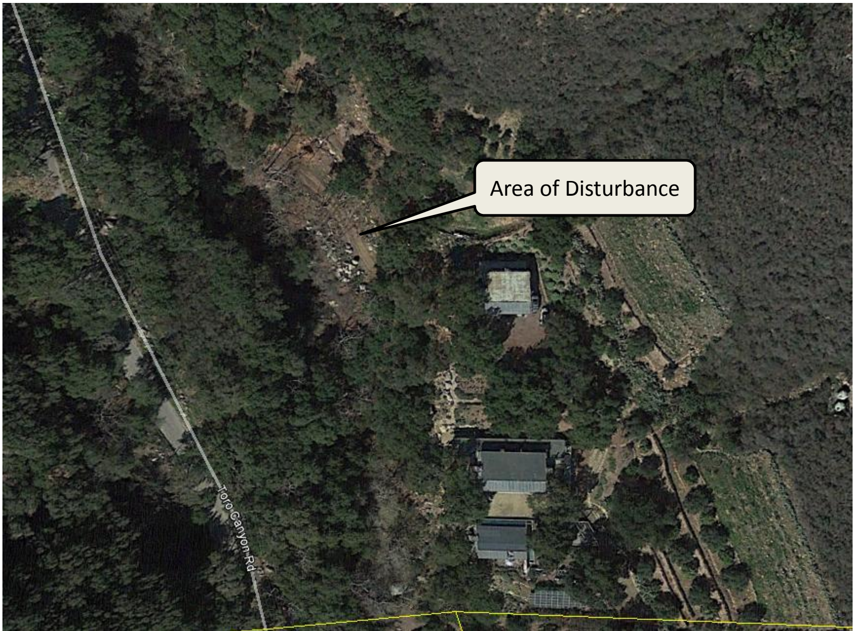
Figure 8.b: Photo of area of disturbance in February 2016.