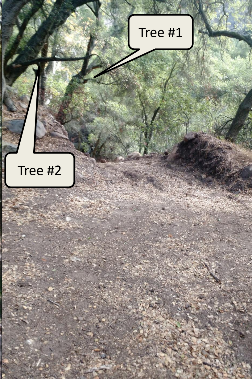
Figure 3: View of secondary access road from Toro Canyon Road. Staff used Google Streetview to show the area in 2012 and compare the area with site visit photos from 2015. A comparison of the photos shows vegetation before and after the unpermitted grading.