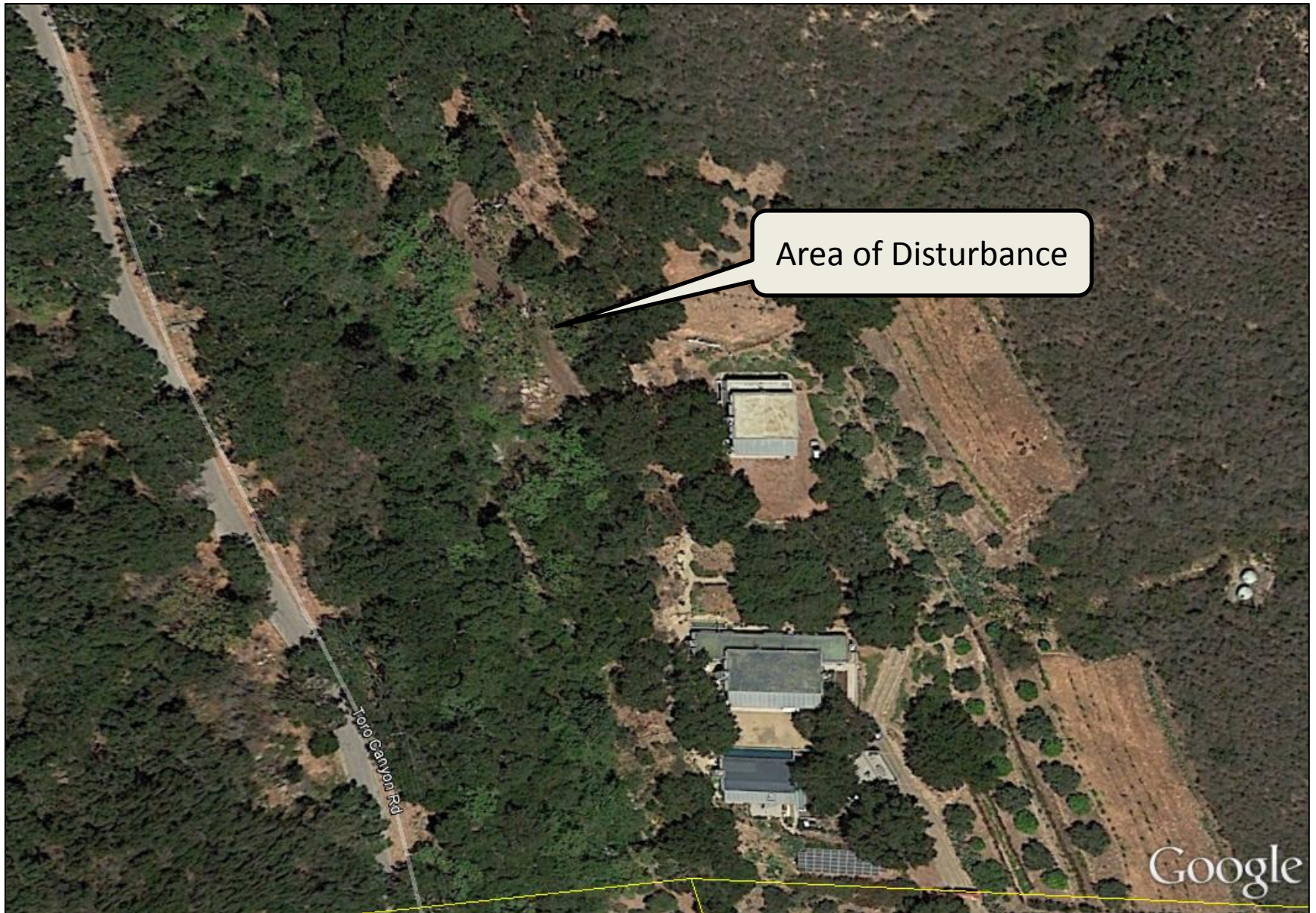
Figure 8.a: Photo of area of disturbance in May 2015.