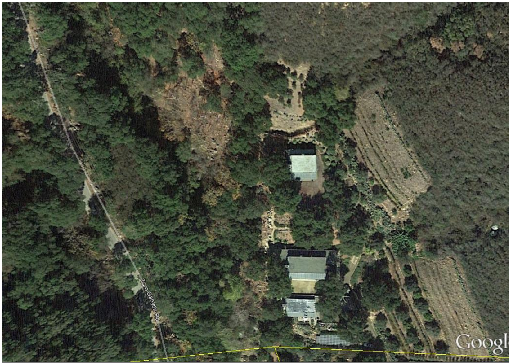
Figure 7.a: Photo of area pre-disturbance in December 2013.