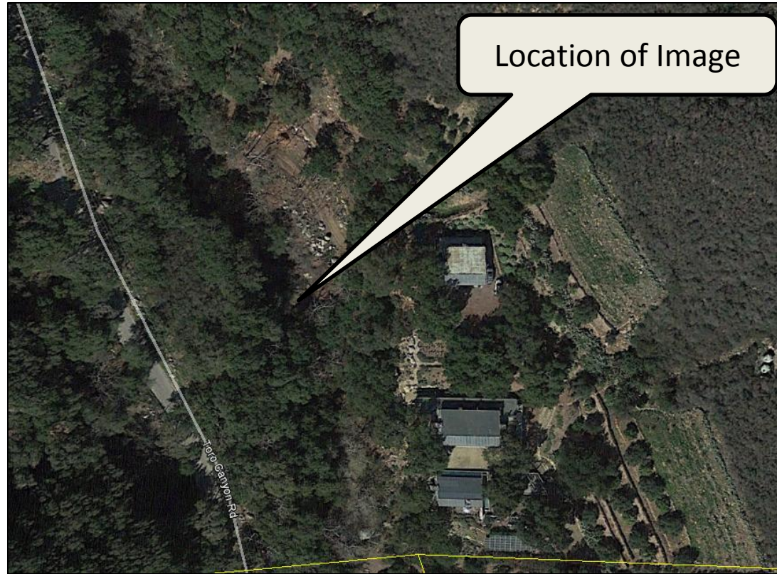
Figure 16: Photo of boulders placed by appellants adjacent to creek and around trunk of an oak tree