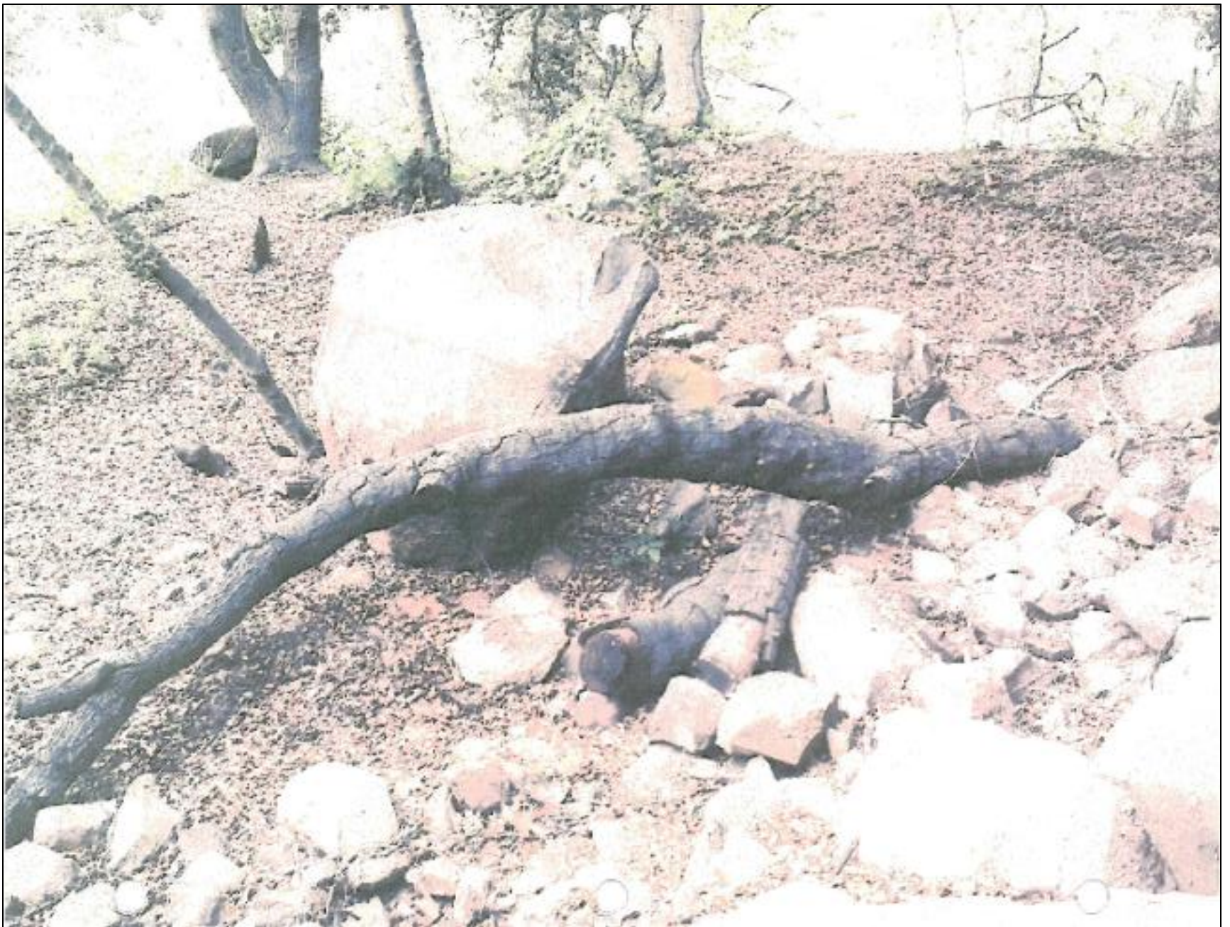
Figure 4: Photo of chopped down oak tree provided by appellants