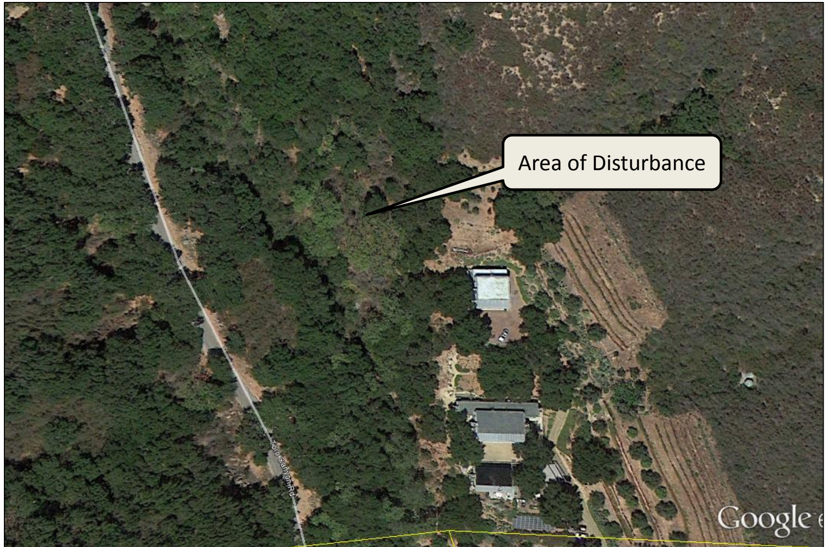
Figure 7.b: Photo of area pre-disturbance in August 2012.