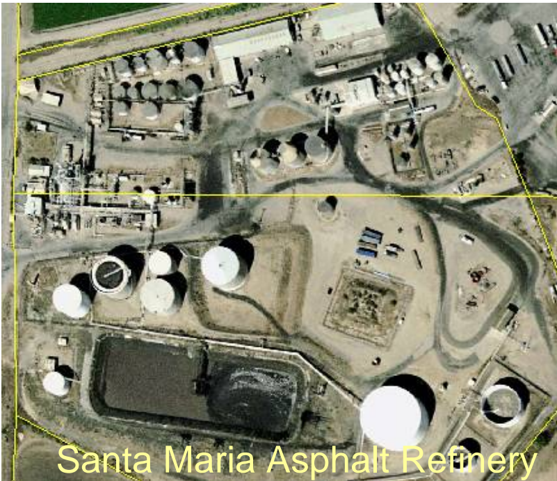
Santa Maria Asphalt Refinery