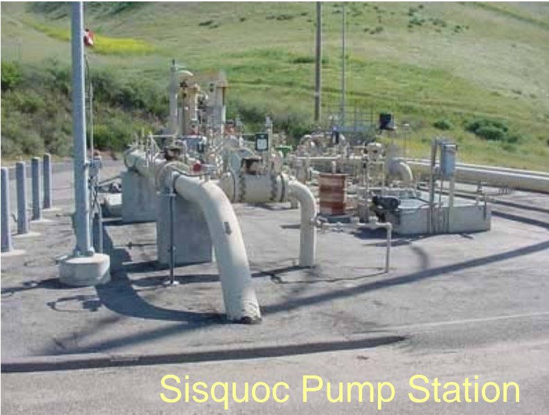
Sisquoc Pump Station