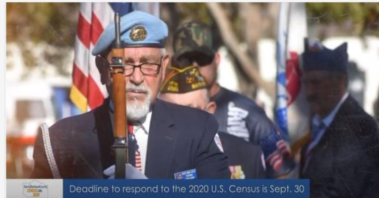
Deadline to respond to the 2020 U.S. Census is Sept. 30

In espanol: https://t.co/fZzPEPdsPu (Haga clic en Subtítulos ocultos)