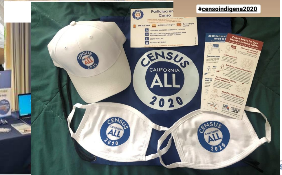
cityofsantamariaPIO @City_SantaMaria · 25 Sep Today the CA Census Digital Truck is driving throughout #SantaMaria reminding everyone to take the #2020Census. It will start at 10:00 am. at Costco then northwest neighborhoods where the self-reporting is lowest, and visit supermarkets, big box stores, pharmacies, and parks.