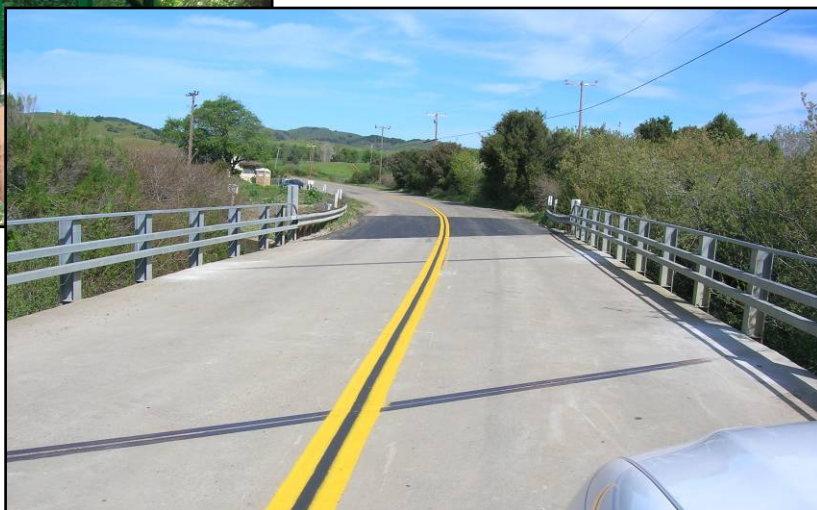
Jalama Road Bridge at Ramajal Creek- No. 51C-016