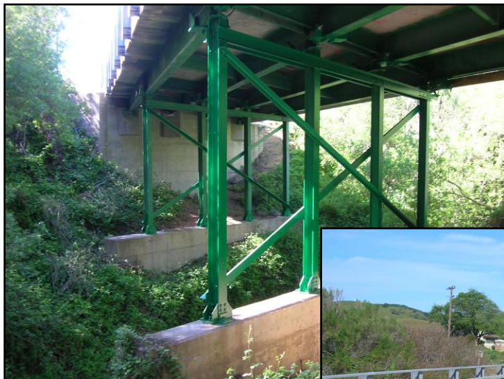
Jalama Road Bridge at Salsipuedes Creek- No. 51C-014