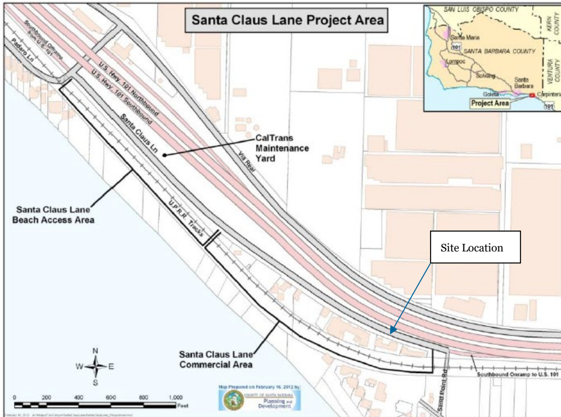
Figure 8 Site Location